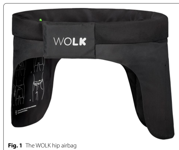
Fig. 1 The WOLK hip airbag

This retrospective study is a before- after comparison of the introduction of the WOLK hip airbag in 11 residential care homes belonging to one long-term care organization in The Netherlands. Figure 2 shows the study design and study periods. In the first period (control period), the WOLK hip airbag was not yet