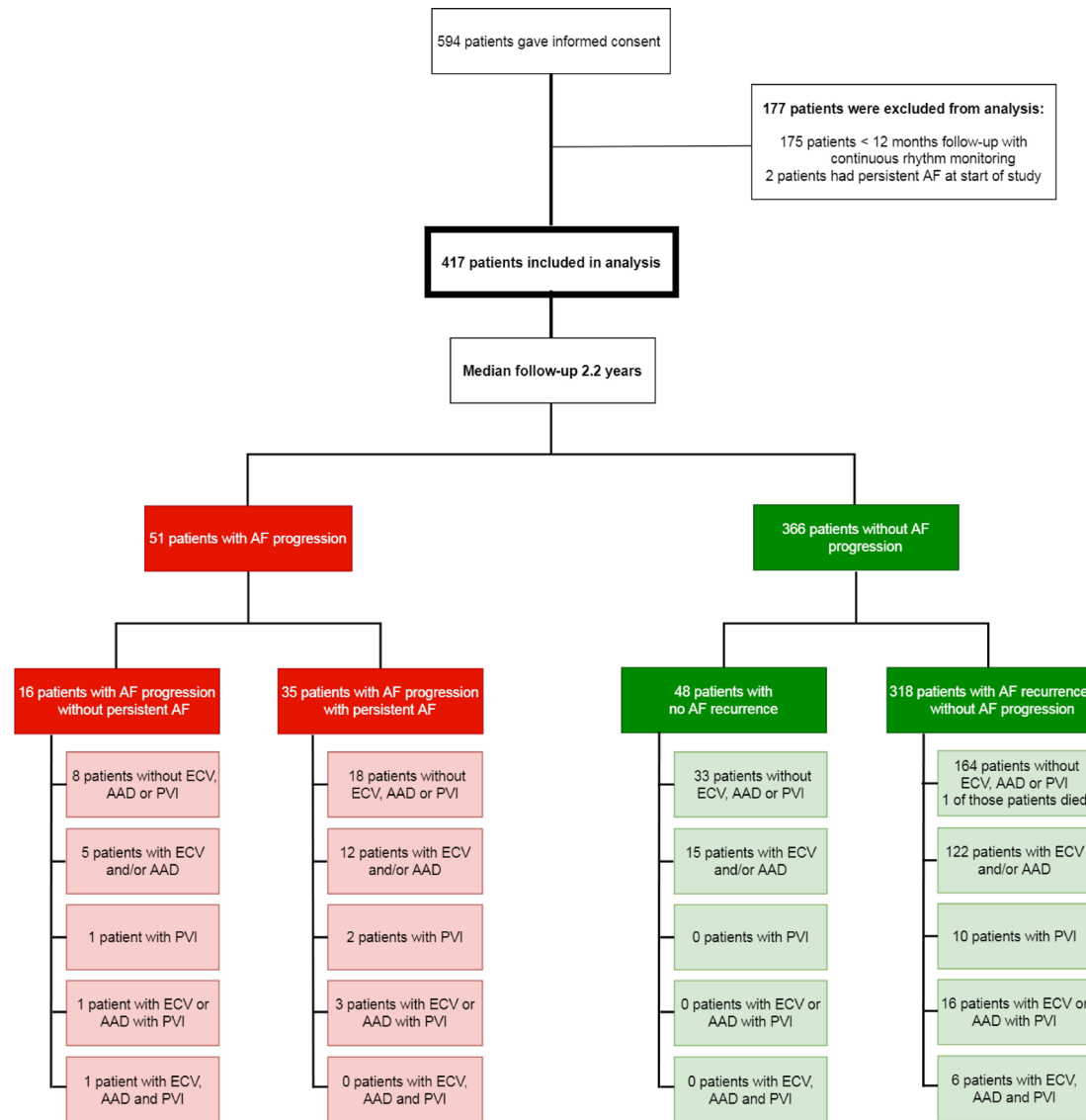
Figure 2 Flow chart of all patients. Four-hundred seventeen patients were included in current analysis. One patient died during follow-up and was included in the analysis until last rhythm monitoring date. AAD, anti-arrhythmic drugs; AF, atrial fibrillation; ECV, electrical cardioversion; PVI, pulmonary vein isolation.

through atherosclerosis and inflammation. 22 Peptidoglycan recognition protein 1 (PGLYRP1), a protein important in the innate immune response, was also associated with AF progression. PGLYRP1 is also involved in inflammation and associated with atherosclerosis. Elevated levels of PGLYRP1 have been associated with aortic wall thickness, aortic plaques and elevated Agatston scores. 23 The fact that PCSK9 and PGLYRP1 were markers for AF progression suggests that vascular processes are of importance in AF progression. 24 25