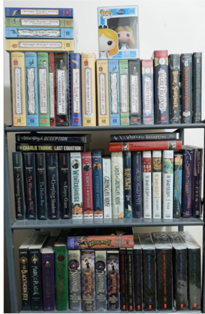
Middle-grade fiction is my best-loved genre. Here are some of the children's books in my personal library. As you can see, I am always in search of new children's book series to read.