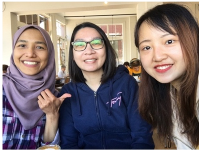
That's me in the center having coffee with two other PhD linguistics students.