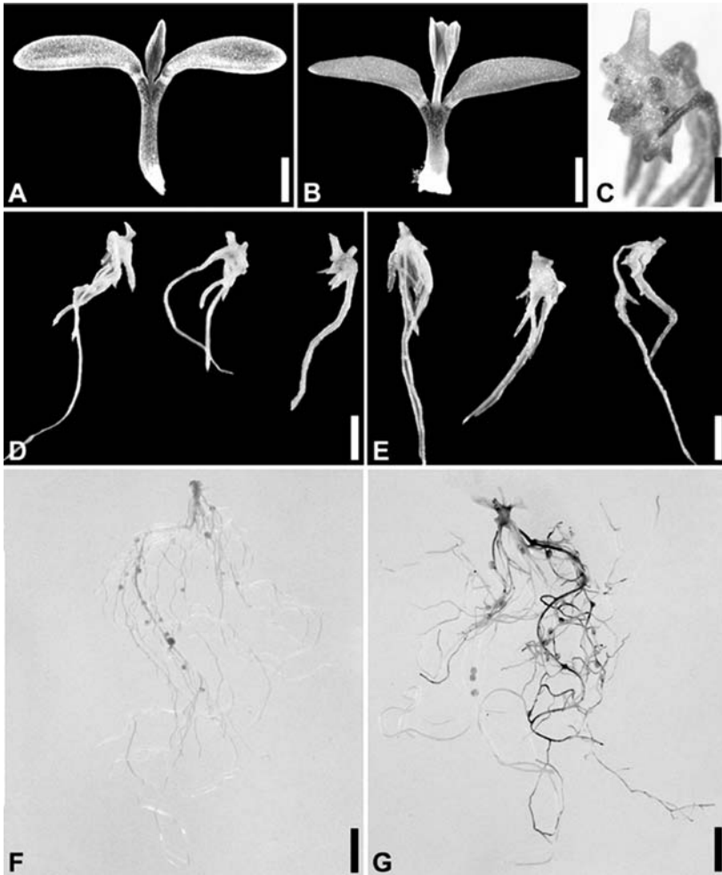
Figure 2. Hairy roots induced by A. rhizogenes LBA 1334 in L. japonicus seedlings. Panel A: there is no swelling observed at the base of the hypocotyl of a Lotus seedling that has not been infected with LBA 1334 4 days after sectioning of the main root. In contrast, a slight swelling and root hairs appears in the area of wounding in a seedling 4 days after sectioning of the main root at the base of the hypocotyl and subsequent infection with LBA 1334 (panel B). Panels C, E, and G show GUS expression as blue precipitate using 5-bromo-4chloro-3-indolyl- \beta -glucuronic acid as substrate in roots transformed with CaMV35S-gus:intron cloned in various binary vectors. GUS histological staining was performed as described in Scarpella et al. (2000). Panel C shows that all emerging hairy roots of a Lotus seedling were transformed with LBA1334 carrying GUS as reporter gene cloned in pCAMBIA1301. Note that GUS is also expressed in loci that have not yet differentiated into hairy roots. Depending on the binary vector used, 5-10% of the transformed plants will show GUS expression in all emerging roots, the rest of the transformed plants will present a combination of GUS-stained and non-stained roots