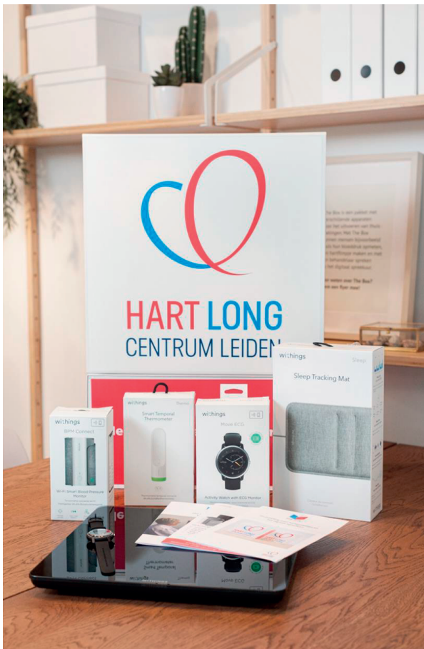
Figure 1: the Box and its contents.

Intervention group patients received mHealth intervention The Box, consisting of an activity tracker, BP monitor, thermometer, and a weight scale (all from Withings, Issy les Moulineaux, France). These devices are shown in Figure 1. During the first two weeks of follow-up, patients were requested to take daily measurements with the Withings devices. For the remainder of the 3-month follow-up, measurements were taken 3 times a week.