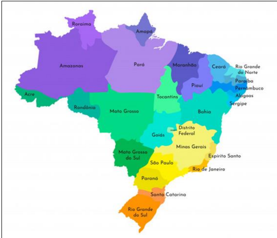
Map of Brazil