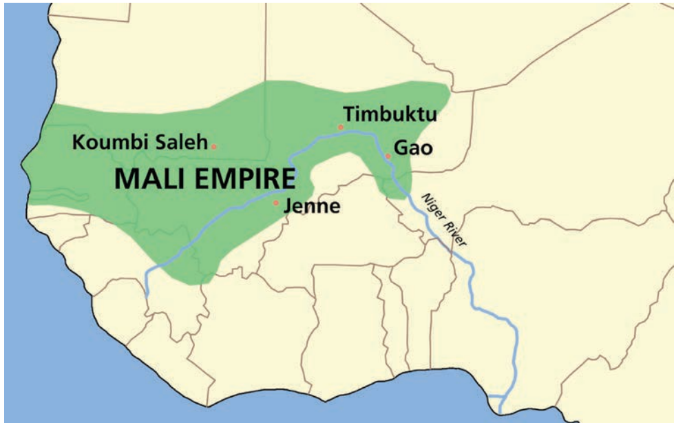
Image 2.5 Empires of Western Sudan

We often think of deserts as natural barriers, but with the domestication of the dromedary camel in the Arabian peninsula around 3000 and 2500 BCE and its subsequent spread across North Africa and the Sahel, movement across the desert became much easier and frequent. Similar also to the role of the Nile in Ancient Egypt, the river Niger functioned as the lifeline for societies in the western Sudan. Many important trading and governing cities such as Timbuktu, Djenné and Gao were along the banks of this more than four thousand kilometer long river flowing East from the Guinean highlands to the West into the Niger Delta at the Atlantic Ocean. With the exception of the inner-Delta in Mali, this river did not provide the same level of fertile silt deposits like the Nile, making farming along its banks more challenging. Yet, it was a very easily navigable river which enabled trade up and down the river with large canoes. The people of the Sahel were situated at the crossroads of trading networks that linked Sub-Saharan Africa to the rest of the then known world, and allowed them to become the intermediaries of trade between the societies in equatorial Africa and North Africa. Three consecutive empires flourished and dominated the area, the Ghana Empire (c. 300 until c. 1100 CE), the Mali Empire (c. 1235 to 1670 CE) and the Songhai Empire (1375-1591 CE).