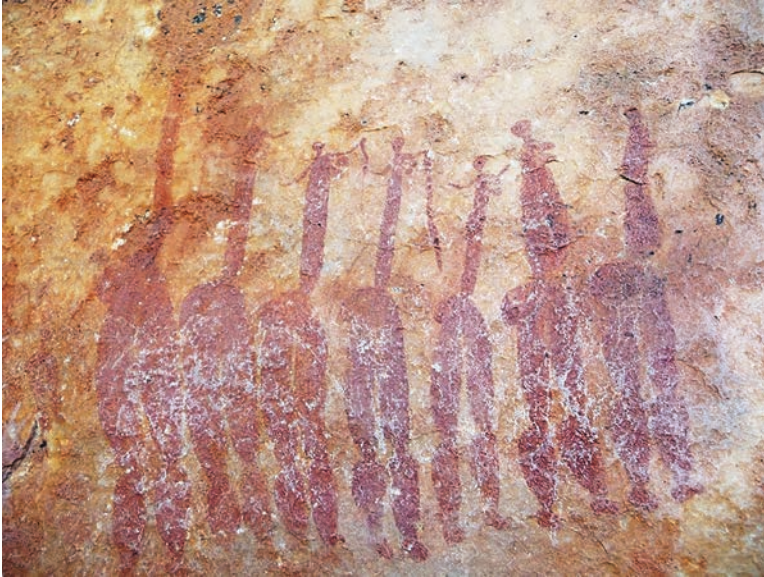
Image 2.1 San Rock Art, Cederberg Mountains, South Africa