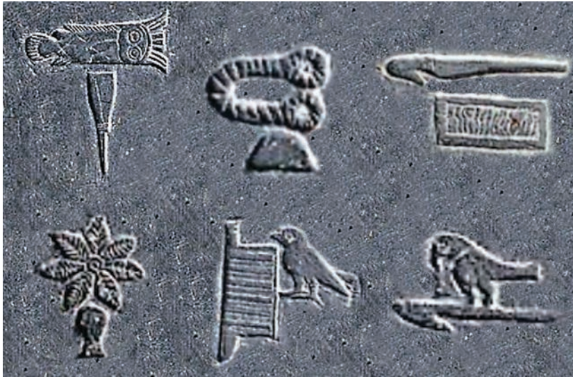
Image 2.2 Proto-Hieroglyphs

Socrates words, that “he who [...] believes that anything in writing will be clear and certain, would be an utterly simple person”.*