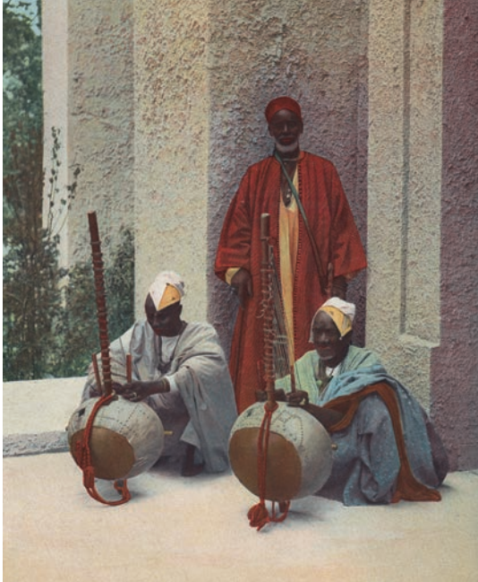
Image 2.6 Kora Playing Griots, Sénégal, 1900 – Colonies Françaises, Sénégal, Soudan Français

Through trade contacts and conquest, Islam had spread to North Africa in the late seventh and eighth century, and progressively reached the West African courts through contact with the merchant classes from the tenth to the fifteenth century. With Islam, the Arabic language and especially Arabic script came to be adopted in the Mali Empire. The rich kings of Mali sought to exhibit their wealth as well as new found devoutness through the patronage of (religious) scholarship. The Malian Emperor Mansa Musa (c. 1280 – c. 1337 CE) (see image 2.7), said to have been the richest man in history, became one of the main patrons of scholarship by financing the Sankoré Madrassah (school of religious learning) in the early fourteenth century, which together with the Djinguereber Madrasah built in 1327 and the Sidi Yahya Madrasah completed in 1440 CE, became part of the University of Timbuktu. The city flourished as the seat of Islamic learning in West Africa. Its Arabophone scholars used Ajami, African languages in Arabic script, to produce great texts of literature and science, thereby promoting African languages as languages of science.* At its height, in the fifteenth and sixteenth century, the university town boasted 25,000 students.**