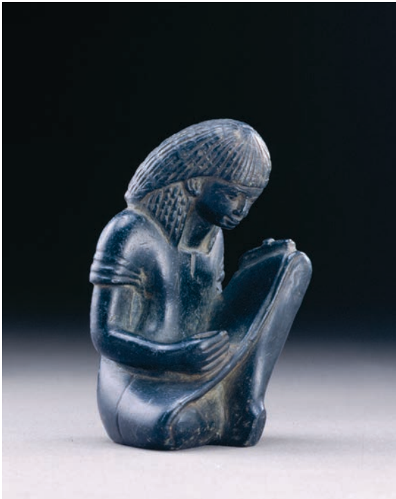
Image 2.4 Seated Scribe, New Kingdom, 1391-1353 BCE

The expansion of a writing culture and corpus of literary texts in ancient Egypt developed through the practice of writing down so-called ‘mortuary texts’, being chants and ritual procedures for funerals, as aide-mémoire . * These written texts never replaced the oral performances, but over time developed into the dominant authority on which scribes and priests came to rely. Scribes (see image 2.4) were the professional class of skilled workers charged with decorating temple walls and recording and copying moral and religious texts as well as tax collections.