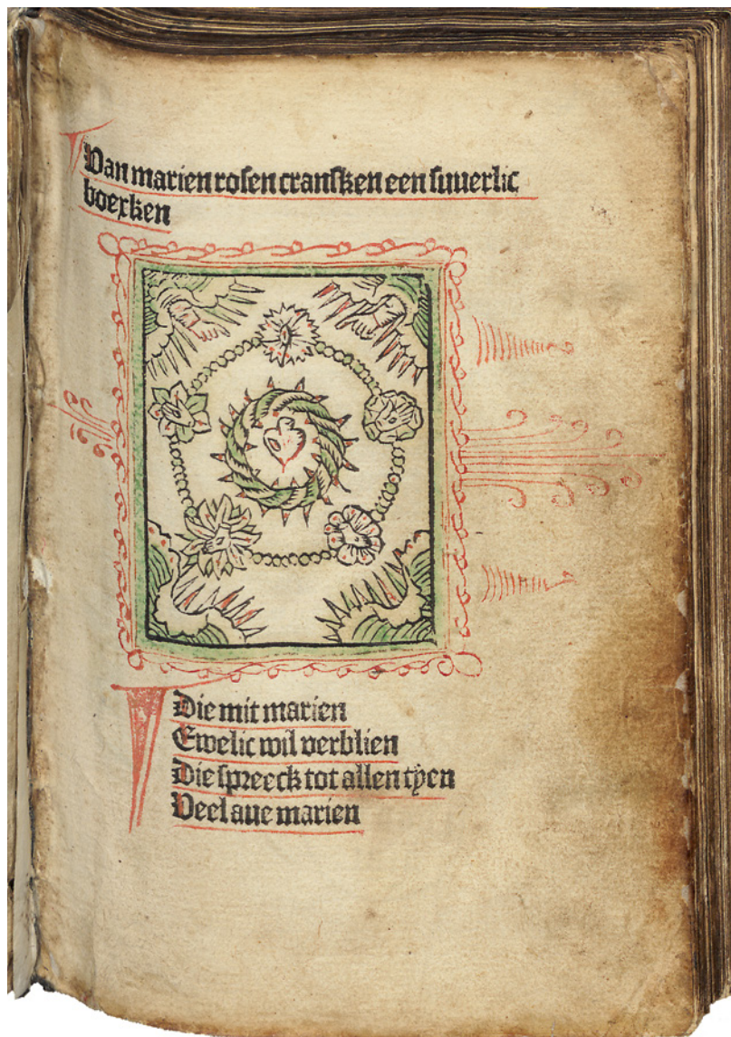
FIGURE 0.1 Title page of Van Marien rosen cransken een suuerlic boexken, with hand-colouring, pen flourishes and rubrication (Gouda, Gerard Leeu: 9 March 1484), 8°. Leiden, University Library, 1370 G 35