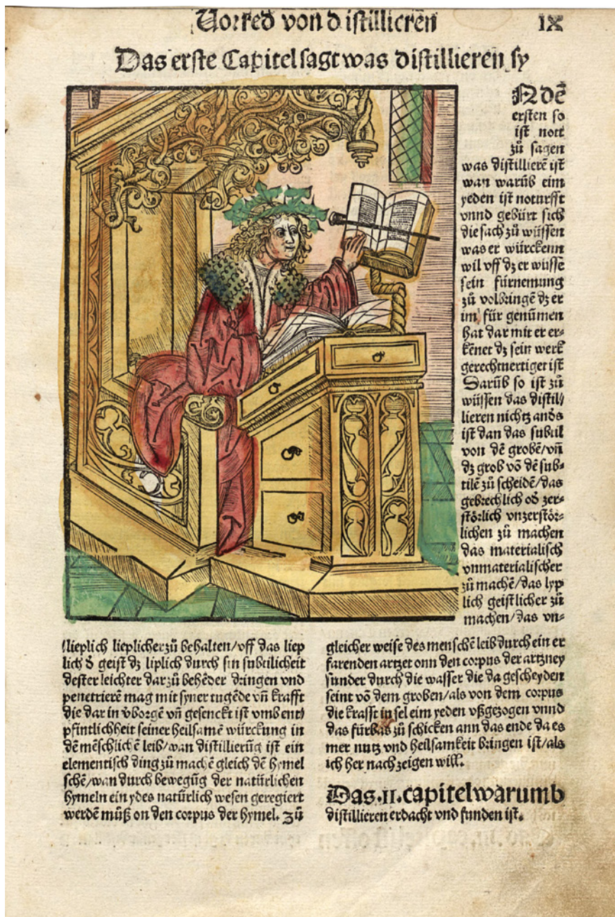
FIGURE 0.3 A man at a lectern with two open books. Woodcut with hand-colouring. Brunschwig Hieronymus, Medicinarius: Das buch der Gesuntheit (Strasbourg: Johann Grüninger, 1505), 2 o , fol. A6r. Munich, Bayerische Staatsbibliothek, Rar. 2128