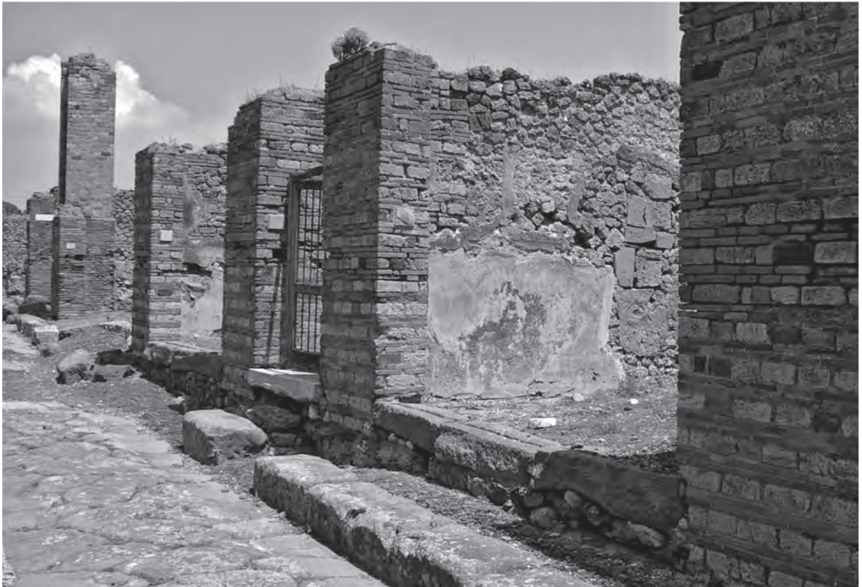
Fig. 4 - Pompeii, house VII 10, 4-6: domestic building with two tabernae .

the main entrance. 20 When elite houses became larger in the late Republic, the number of tabernae increased proportionally, and where this was convenient, tabernae also were built on the sides of houses. 21 These basic architectural models are found throughout Roman Italy and continued to be popular throughout the Imperial period. In addition, domestic architecture appears to have been able to accommodate workshops from early onwards. In Pompeii, some early houses appear to have had a separate section, next to the domestic core, that offered space for commercial facilities; in the early imperial period, the larger workshops of the city were situated in the back parts of houses, either next to or instead of the back yard. 22 To some