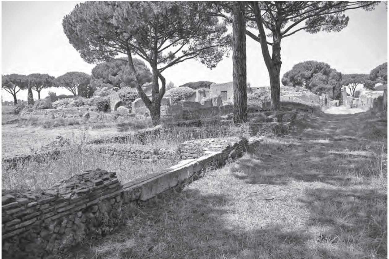
Fig. 7 - Ostia IV i 9. Row of tabernae in front of the Campus of Magna Mater.

ond century AD, equipped with a row of tabernae along the street, instead of what previously had been a closed wall (fig. 7). 36 It seems clear from the architecture in both cases that the tabernae actually were built on ground owned by the sanctuary – remains of the former perimeter wall have remained visible. The situation suggests that the sanctuaries took advantage of the changing economic circumstances in the city, and their suddenly rather central location. Yet, the actual ownership situation remains unclear – it is possible that the sanctuaries and the tabernae were public property rather than independent, self-managed organizations. Elsewhere in the city, in the same period, two smaller collegial temples also were built with tabernae flanking their main entrance – this is true for both the temple of