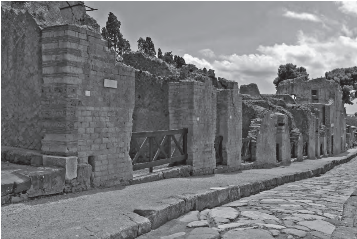
Fig. 8 - Herculaneum, tabernae in the façade of Insula Occidentalis 2 .

long seen by many as a sanctuary of Pompeii's public lares, the building was seen as a 'library' by Richardson Jr. in the 1980s, while it was identified by Dobbins as an 'imperial cult building' in the 1990s. 40