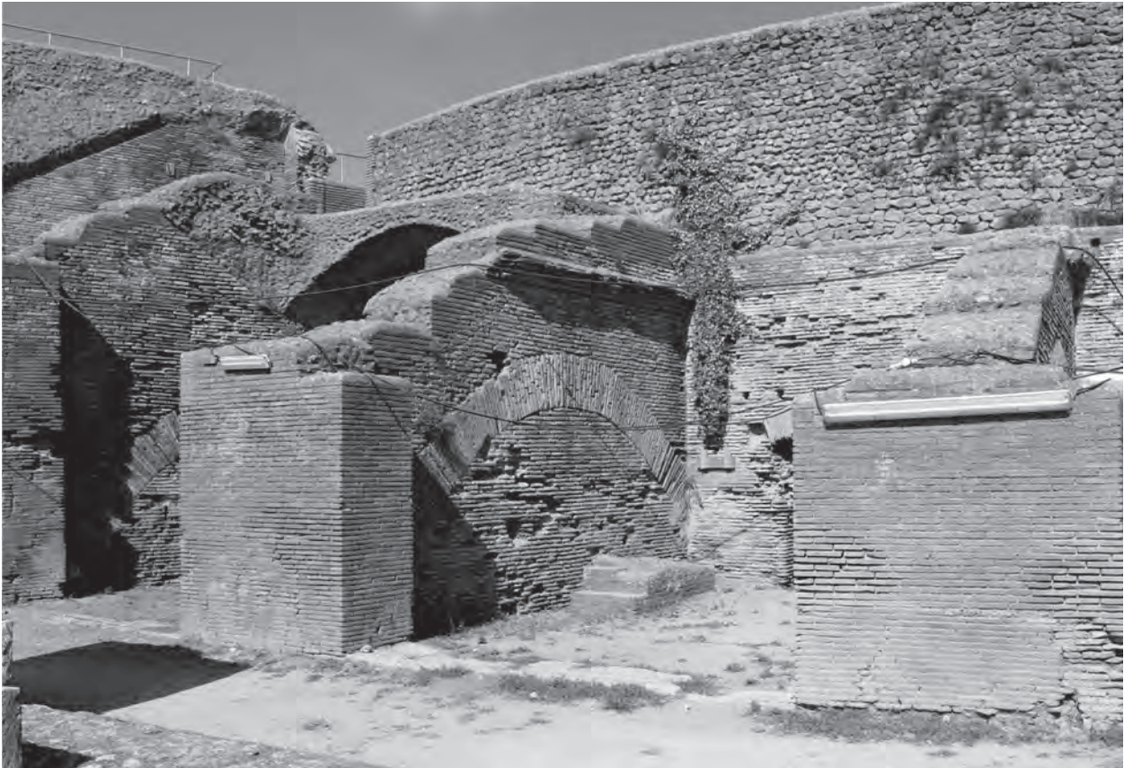
Fig. 5 - Ostia, Theatre. Tabernae underneath the cauea .

were surrounded by façades including long rows of tabernae in some of the most commercially attractive places in the city. 24 At Ostia, this development becomes even more pronounced, with tabernae not only surrounding the larger public bath complexes, but also occupying the vaults underneath the cavea of the theatre (fig. 5). 25 In Rome, the remains are more fragmentary, but a similar development appears to have been taking place, e.g. underneath the cavea of the Circus Maximus, and in front of the Baths of Caracalla. 26 Another development that can be seen in all three of these cities is the development of large-scale purpose-built commercial architecture, including long rows of tabernae along the major urban thoroughfares, and production