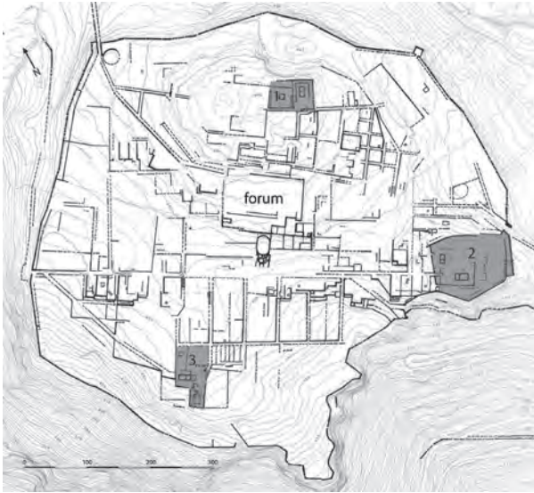
Fig. 1 - Norba. Plan of the city with the location of the forum and the main urban sanctuaries.

in Roman Italy. Most of these settlements were situated on hilltops, so that there were significant height differences within the city. These played a crucial role in the constitution of the urban religious landscape. 6 At Norba, (re)founded by the Romans in 492 BC, but completely reorganized in the fourth century, there were clusters of temples in three places (fig. 1). One was situated close to the highest point of the city, on the so-called ‘major’ acropolis; another one was situated on a lower, second hilltop – the minor acropolis – overlooking the city centre and the Pontine plain; the third was situated close to the edge of the plateau on which Norba was situated, on a low hill in the south-west half of the urban area. 7 All three locations were marginal with respect to the urban street grid – in a way that is comparable to the contemporary situation at Ostia, the temples surrounded the city rather than being an integrated part of it. At Alba Fucens, founded in 330 BC, there were temples on all three hills surrounding the area of the forum . 8