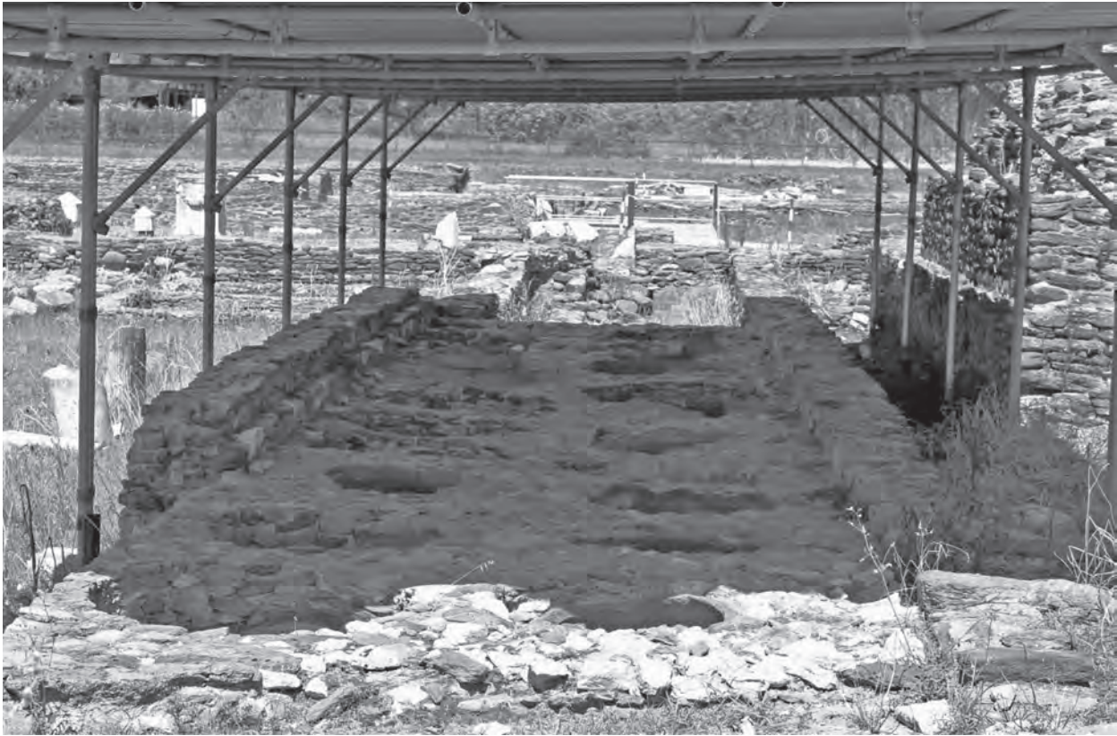
Fig. 6 - Luni, dolia behind the so-called 'Temple of Diana'.

attractive places in town – its construction in the Augustan period probably went at the expense of high-profile commercial space. Thus, throughout Roman cities, commerce formed the background of religious experience, and vice-versa.