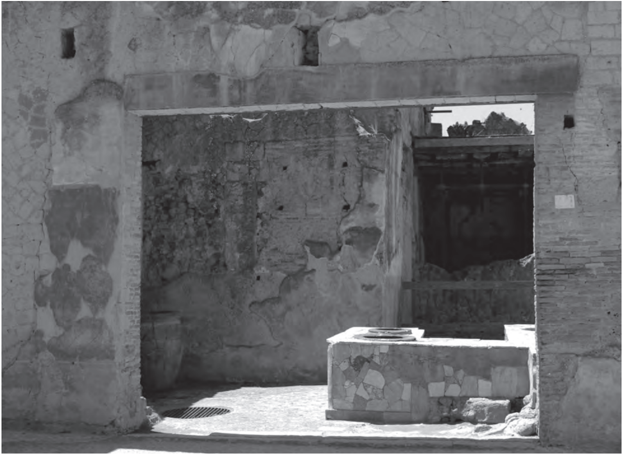
Fig. 3 - Herculaneum, taberna VI, 10.

while Vitruvius advises architects to design fora with tabernae that return money to the public treasury. 18 Though not all fora were surrounded by rows of tabernae , permanent facilities for commerce that bordered directly on the main urban plaza became common throughout Italy, and remained so throughout the Roman period. Imperial period examples from Italy include the forum of Brescia, lined with tabernae on both long sides, the forum of Suasa, surrounded by tabernae on three sides, and the forum of Herdonia, built as one coherent complex with rows of tabernae and a macellum in the second century AD (see below). 19 It is generally impossible to understand whether all these tabernae were used for business, retail or manufacturing