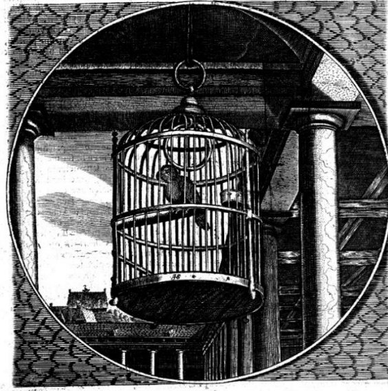
Figure 2 Emblem of poem 14, “Amissa libertate laetior” in Jacob Cats’ 1627 edition of Sinne- en minne-beelden