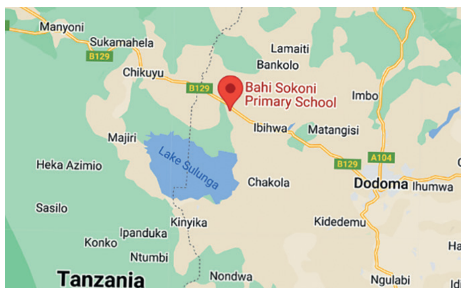
Map 4 Bahi Sokoni

Data collection in the area took place in August- September 2017 and started with a reconnaissance by foot, motor cycle and car through all the wards of Bahi district to refine the general picture of agricultural transformations and to introduce the upcoming fieldwork to all formal and informal key-persons in the respective villages and wards. On the basis of information collected, Bahi ward was selected to represent wards with agricultural transformations. Chipanga ward was selected to represent wards with few or none agricultural transformations. Bahi ward consists of three villages: Bahi Sokoni, Uhelela and Bahi Nagulo. Bahi Sokoni was selected to represent Bahi ward (see map 3). Chipanga ward consists of the Chipanga A, Chipanga B and Chiguluka villages. We choose Chipanga A (see map 3) to represent this ward.