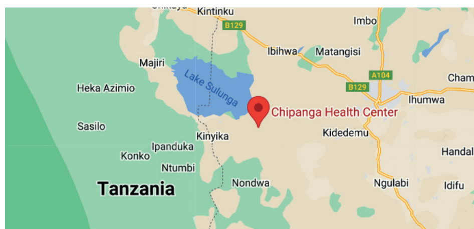
Map 5 Chipanga A

In order to determine the impact of agricultural transformations on rural livelihoods we organized a number of focus group workshops (FGWs) in Bani Sokoni and Chipanga A.