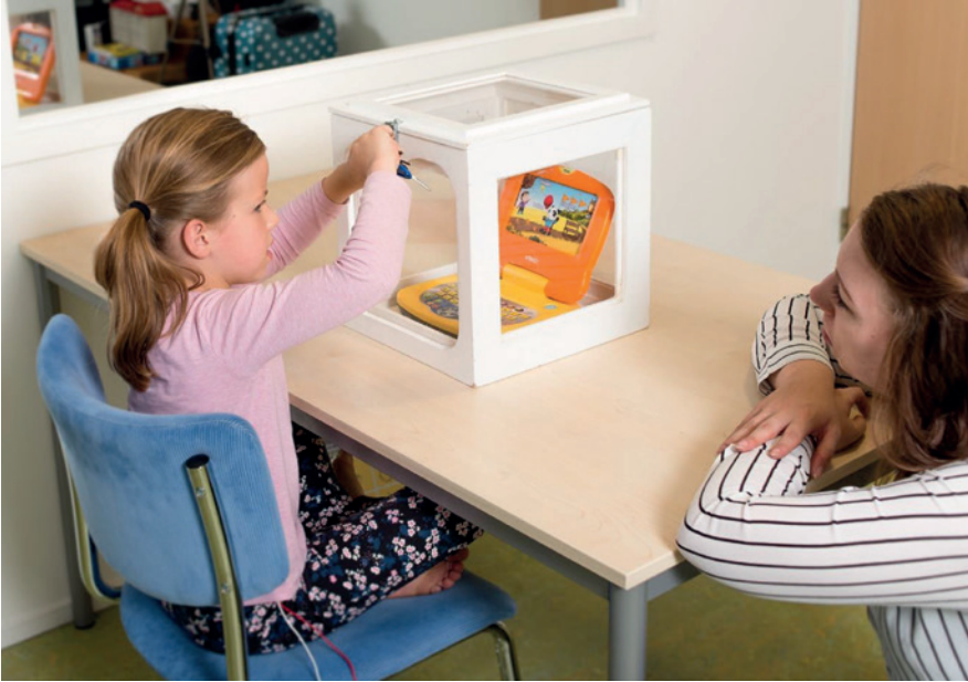
Figure A1 Professionally Edited Photo of the Locked Box Task.

Note. This photo was not part of the original submitted manuscript and was originally made for PR purposes of the TRIXY Early Childhood Study.