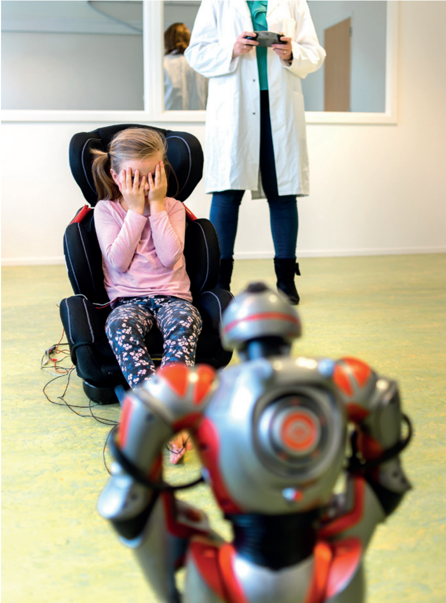
Figure A1 Professionally Edited Photo of the Unpredictable Mechanical Toy Task.

Note. This photo was not part of the original published manuscript and was originally made for PR purposes of the TRIXY Early Childhood Study.