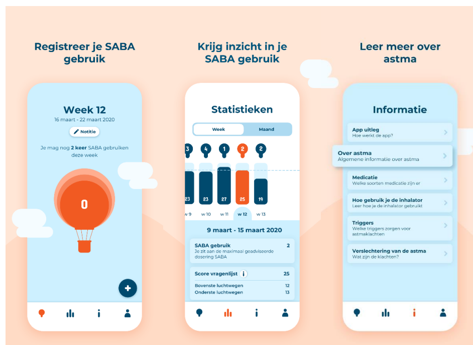
Figure 3. Visuals of the final version of the Asthma app. “Registreer je SABA gebruik” means “Register your SABA use”, “Krijg inzicht in je SABA gebruik” means “Get insight into your SABA use” and “Leer meer over astma” means “Learn more about asthma”.

The final version of the app is shown in Figure 3. The app allows users to register their SABA use directly. Moreover, asthma symptoms can be measured weekly, and participants can register the triggers of these symptoms at any time. A graphical overview shows how SABA use, asthma symptoms, and their triggers are related. In the app, the amount of SABA use is compared to the existing guidelines or, when applicable, to the advice given by an HCP. The guidelines advise using SABA twice per week [3]. Psychoeducation is also included in the app, covering topics such as “what is asthma”, “types of medication and their function”, and “asthma control”. The researchers created this written information on communication level 1B (on the scales of the Common European Framework of Reference for Languages [49]).