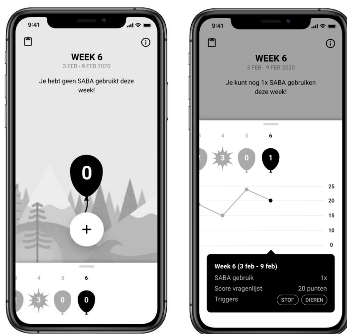
Figure 2. Prototype of the app.

showed how much SABA the user had taken that week. After every SABA registration, the balloon would inflate a little. The balloon would burst when the maximum dose of two SABAs per week, which is the standard recommendation [3], was exceeded. Additionally, textual information was shown, for example, “you have not yet used any SABA this week”. The other page consisted of (a) a graphical overview of the amount of asthma symptoms (assessed using the Control of Allergic Rhinitis and Asthma Test [CARAT]) [47,48], (b) the amount of SABA used per week, and (c) symptom triggers that were entered.