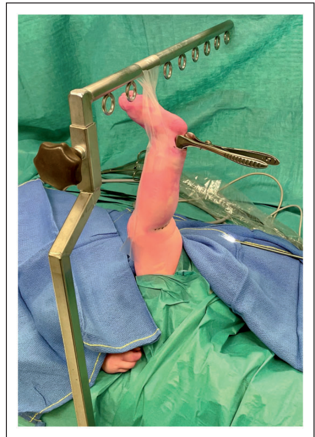
Figure 1. Theatre set-up showing the child in supine position with the left leg suspended from a table-mounted bar (head of the patient is to the left of the picture). The Kilian nasal speculum is seen inserted in the distal incision.

malleolus and neurolysis is done under loupe magnification using Jameson scissors. After neurolysis of approximately 3 cm of the SN, a Kilian speculum is inserted with the blades medial and lateral to the SN. The speculum can also be used for blunt dissection by opening and closing manoeuvres to create a proper corridor until it can be inserted to its full