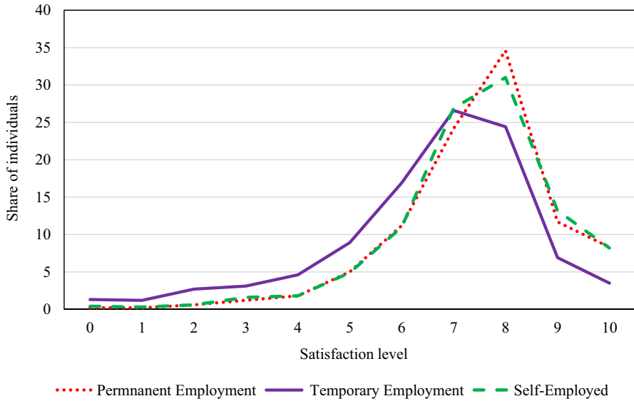
Fig. 3 Career satisfaction levels, across types of employment.

can become a trap leading to social exclusion (Bolhaar et al., 2018; Buiskool et al., 2016). When the data on consecutive temporary jobs will be available for more years, it will be interesting to investigate whether individuals with a migration background and language problems tend to have labor market trajectories characterized by consecutive temporary occupations.