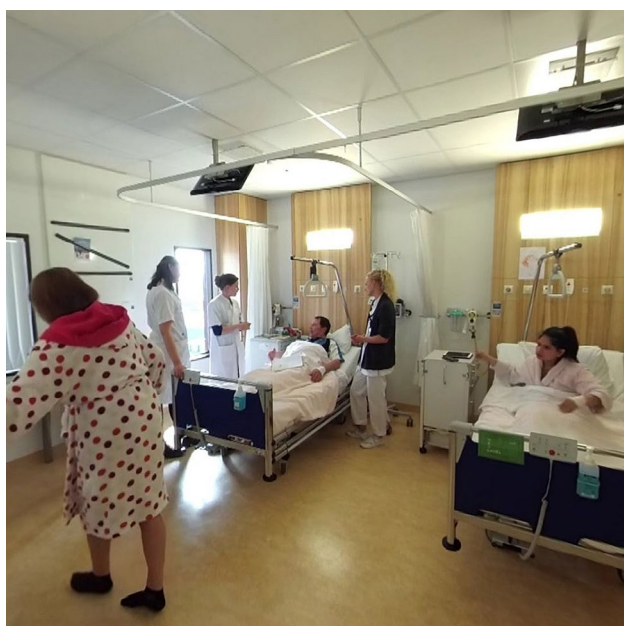
Fig. 2 Still of the VR application ‘(Un)professional behavior’, showing a ward round by a team of a nurse, resident and medical student