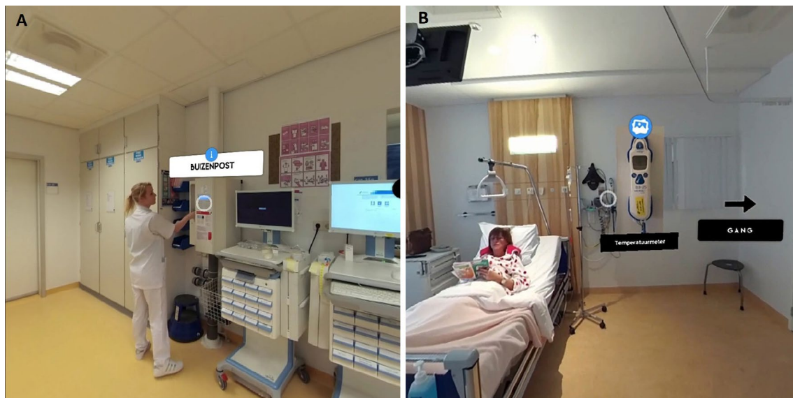
Fig. 1 Stills of the VR application 'Virtual Ward' A Nurse working in the nursing station and using the pneumatic tube system; a hotspot provides the additional textual information "Buizenpost" (translation from Dutch: pneumatic tube system ) B A patient in a patient room; a

From June 2018 until July 2019, 26 groups of students (280 students in total) were asked to fill out the online questionnaire. A total of 171 completed questionnaires were collected: a response rate of 61%. Students who had been involved in the design team were not allowed to participate in this study. All students provided consent for use of their anonymized data for research purposes. The general characteristics of the study participants is shown in Table 1.