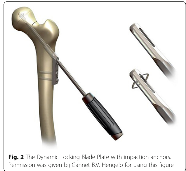
Fig. 2 The Dynamic Locking Blade Plate with impaction anchors. Permission was given by Gannet B.V. Hengelo for using this figure

objectives are to determine the incidence of AVN, non-union, implant related complications, non-implant related complications and elective removal after fixation with the DLBP or DHS. Also, we compare operating time, functional outcome and cost-effectiveness of DLBP and the DHS.