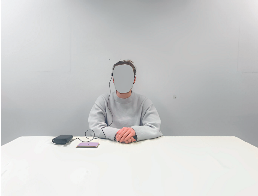
Figure 1. One of the reference images depicting the conversation task; the gray circle is the face AOI

The following parameters were exported: (1) total fixation count in each segment. (2) Total duration of each segment in seconds. (3) Total fixation count on the face of the confederate in each segment. (4) Total fixation duration on the face of the confederate in each segment in seconds. Three eye-tracking measures were calculated in this study: (1) The total fixation duration on the face of the confederate, which was the sum of all fixations on the face over the course of a speech turn. (2) The proportion of fixations on the face of the confederate, which was computed by dividing the fixation counts on the face by the total fixation counts. (3) The mean fixation duration on the face, which was computed by dividing the total fixation time on the face by the number of fixations on the face.