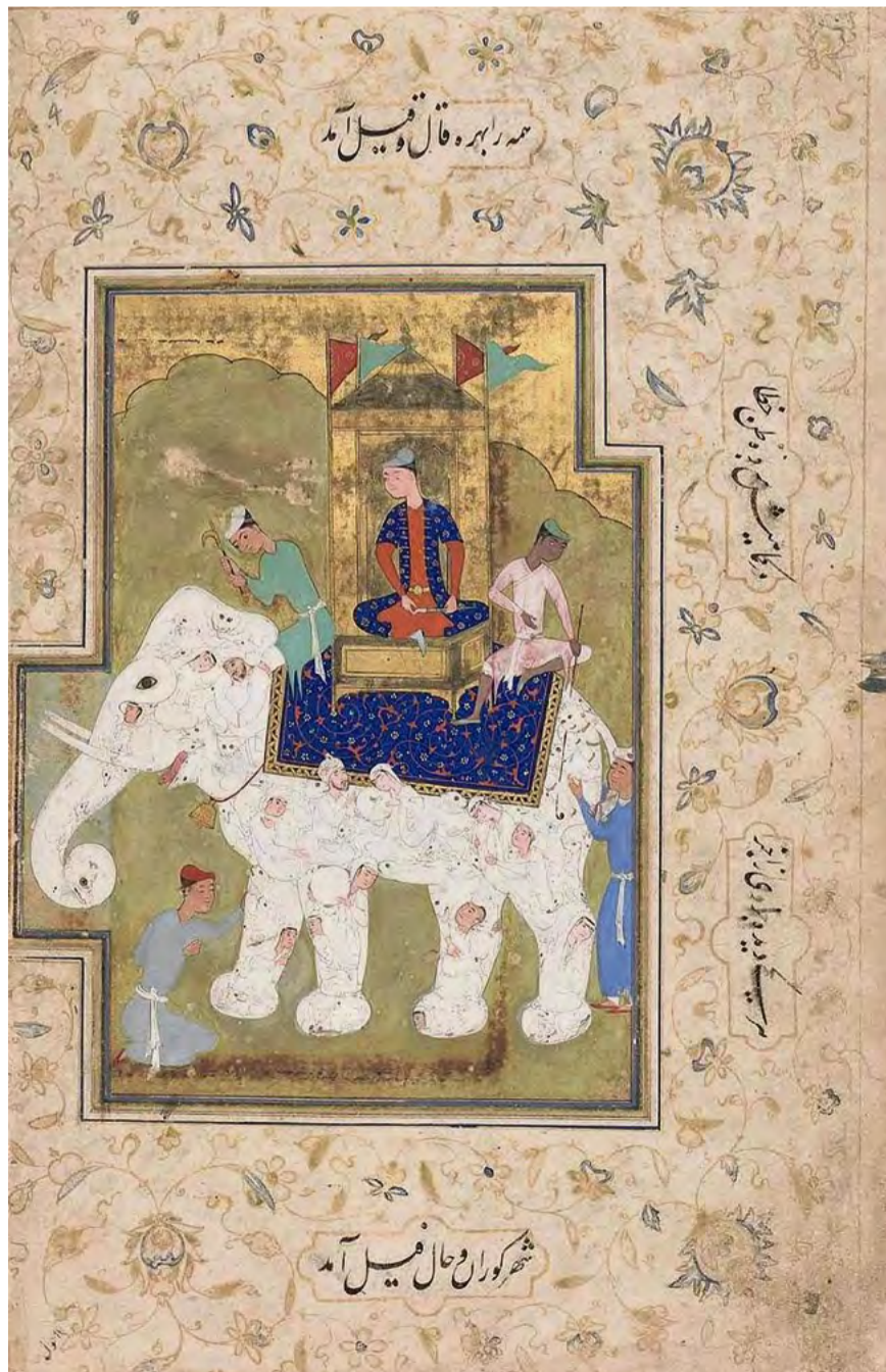
Fig. 1: Illustration of a story of an elephant and blind men in the late-16th-century Persian manuscript. Denman Waldo Ross Collection, Accession number: 09.324c

In Europe, a navanārikuñjara motif can be found in the Dutch Republic through an art piece by the 17th-century Dutch painter Willem Schellinks (1627-1678). Despite the elephant representation, he had never traveled to Asia. His "visit" to Asia was mediated through his networks which