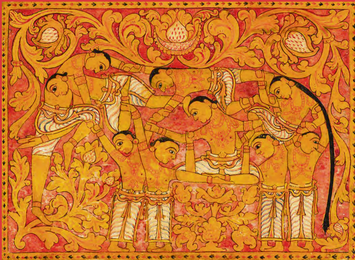
Fig. 6 (left): A navanārikuñjara elephant in a 19th-century Thai elephant treatise. Digitised Manuscript, Shelfmark: Or 13652, fol. 18r © British Library Board.