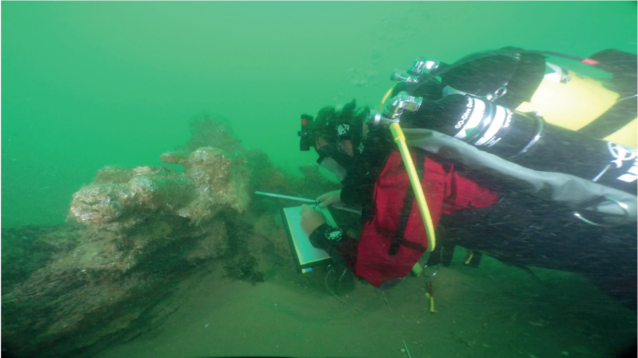
2. The Manders diving on the wreck of the Dutch East Indiaman 'Rooswijk' that wrecked on the Goodwin Sands in the UK in 1740.

Kwaliteitsnorm voor de Nederlandse Archeologie (KNA). 21