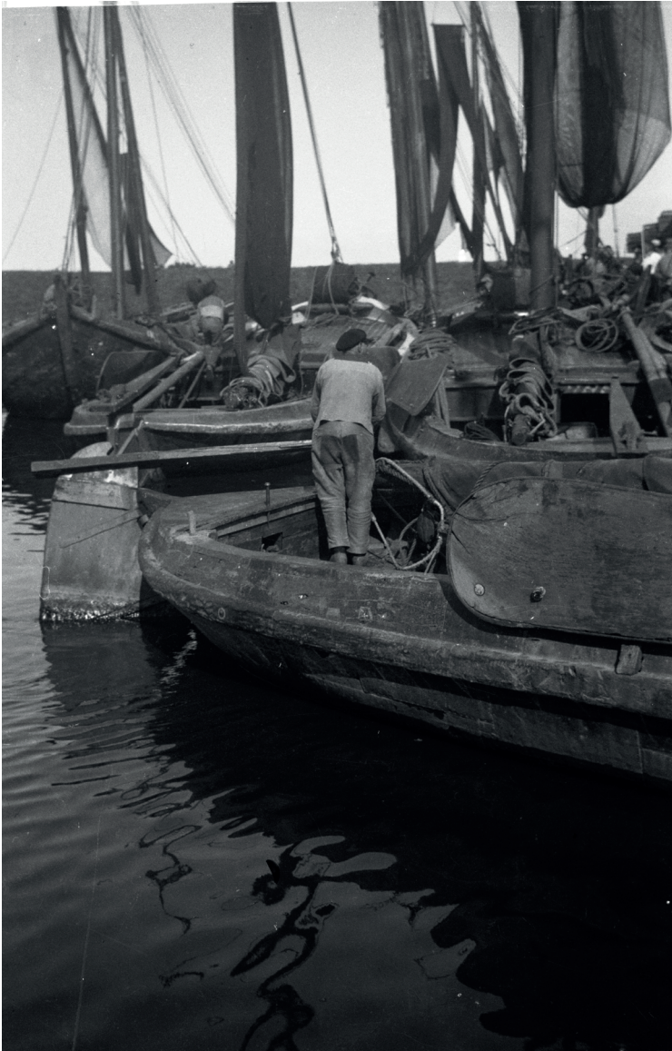
4. Boppers (flat-bottom-ships) in the Zuiderzee. This photo was taken in the early 1900s when this inner sea was still connected to the Wadden Sea.

measurements, and of course structural monitoring, where the results should really lead to actions in the mean time. Of course this is a strategy that requires capacity and money. The more we want to protect, the more expensive it gets. It is not surprising then that at some point a reality check is needed to compare importance, practicality and associated costs. But it is also extremely important that a weighing of importance is also conducted at regional and local level. And with the idea in mind that ‘he who pays the piper calls the tunes’, it is a logical assumption that budgets for underwater heritage management should also be made structurally available on a regional level.