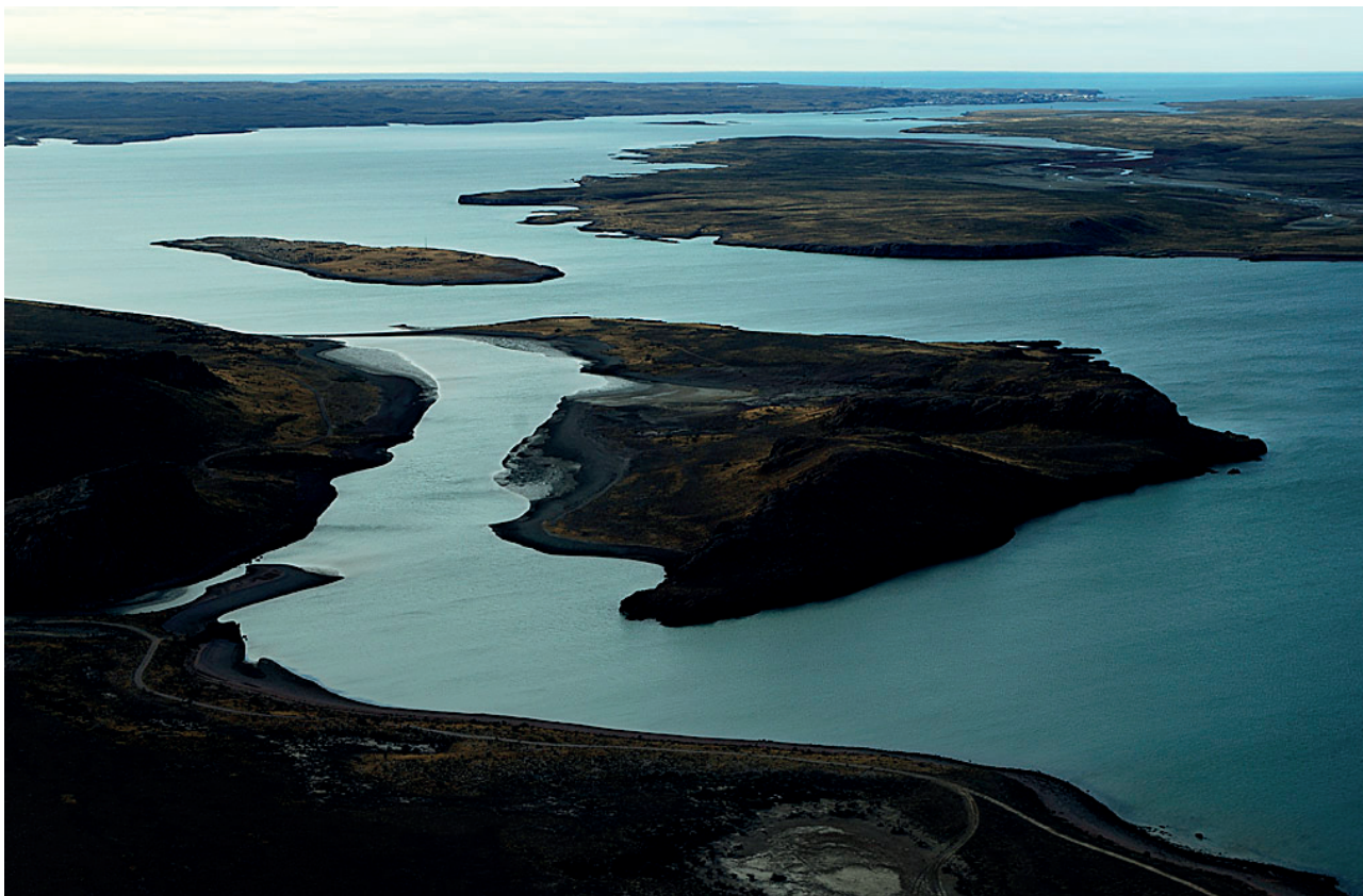
1. The Ria Deseado, an inlet from the sea in Patagonia, Argentina. This is the place where the 'Hoorn' from the Southern Company wrecked in 1615.

All these fantastic archaeological sites under water... Yet if we were to compile a top ten of the most important underwater sites, yours will probably differ a bit from mine. Without doubt we would also see that lesser known sites would often end up at the bottom of the list. For as they say: out of sight, out of heart. Yet as soon as we would learn more about these wrecks or other archaeological sites, this list would be shaken up again. When we see something, we can appreciate it a bit more. This principle has been described well in the Heritage Cycle