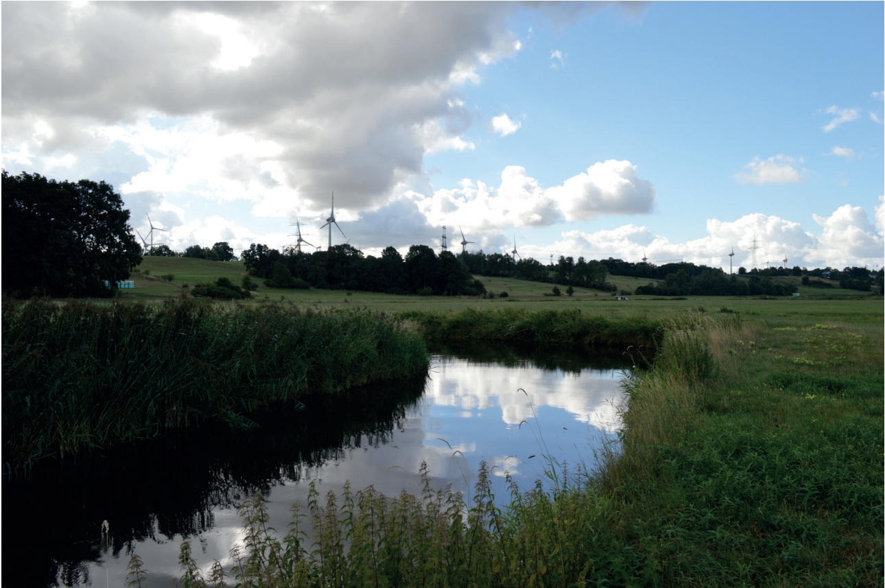
3. The Tollense River in North-eastern Germany where in 1300 BCE a battle took place.

some people will say that we still have the sites on land and the knowledge we received by digging those. They have a point, yet not (or hardly) including sites under water in the official protection measurements and communications adds to their invisibility and the lack of interest we spoke about before. They are out of sight under a blanket of murky water, and thus out of heart, whereas the official Dutch history in 50 windows – the Canon of the Netherlands – is littered with important events that do have a considerable maritime component