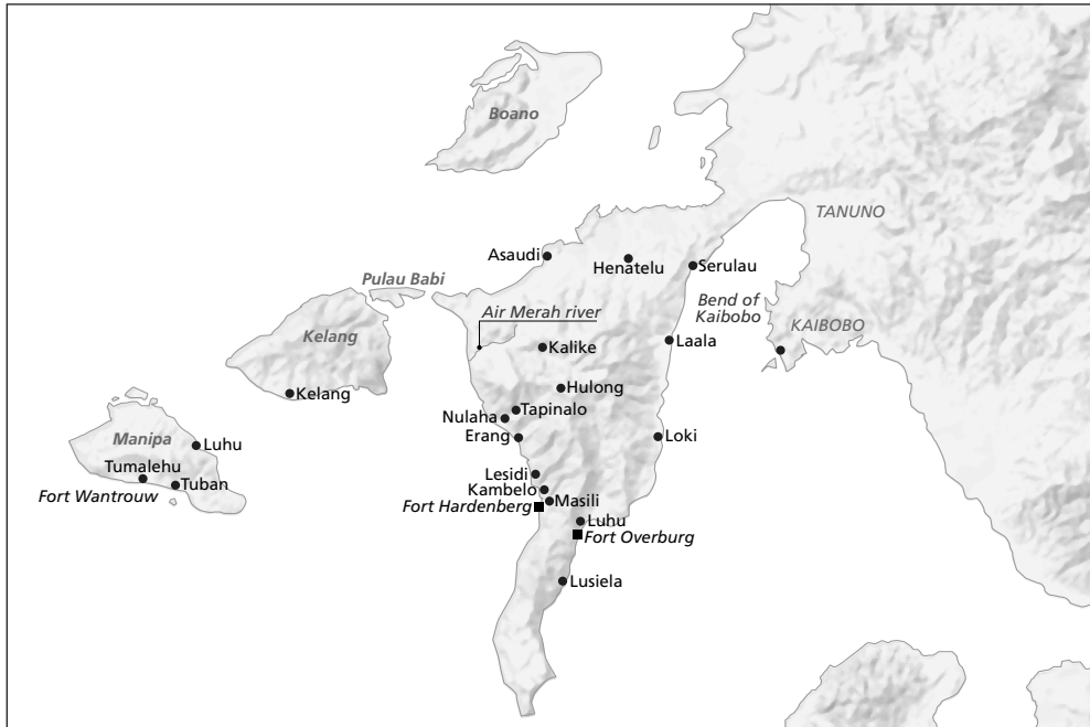
Map 5 The Hoamoal peninsula and the adjacent islands of Boano, Kelang and Manipa.