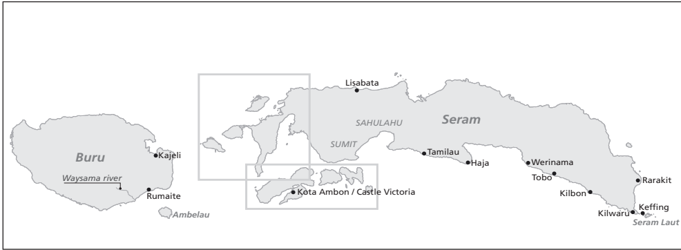
Map 3 Seram, Buru and environs. Refer to detailed map 4 for the Ambon and the Lease Islands, and detailed map 5 for the Hoamoal peninsula and the surrounding islands.