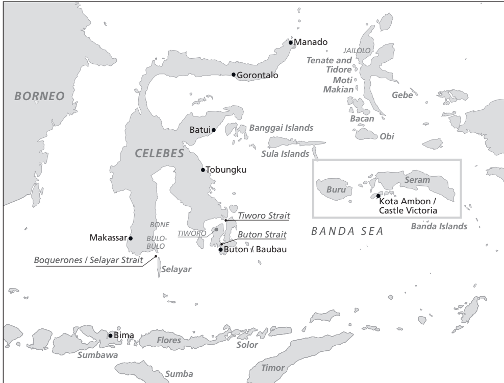
Map 1 The eastern archipelago