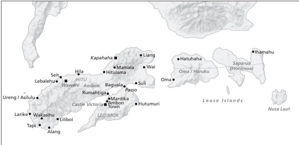
Map 4 Ambon and the Lease islands. The dotted lines are a rough indication of the early 17th century division between Christian (usually ulisiwa ) regions under Company rule to their south, and Muslim (usually ulilima ) regions to their north. On Ambon, the area north of the line is the Hituese state; the western corner of the Hitu peninsula separated by the smaller line is the Muslim area that was not part of the Hituese state but stood under Company rule.