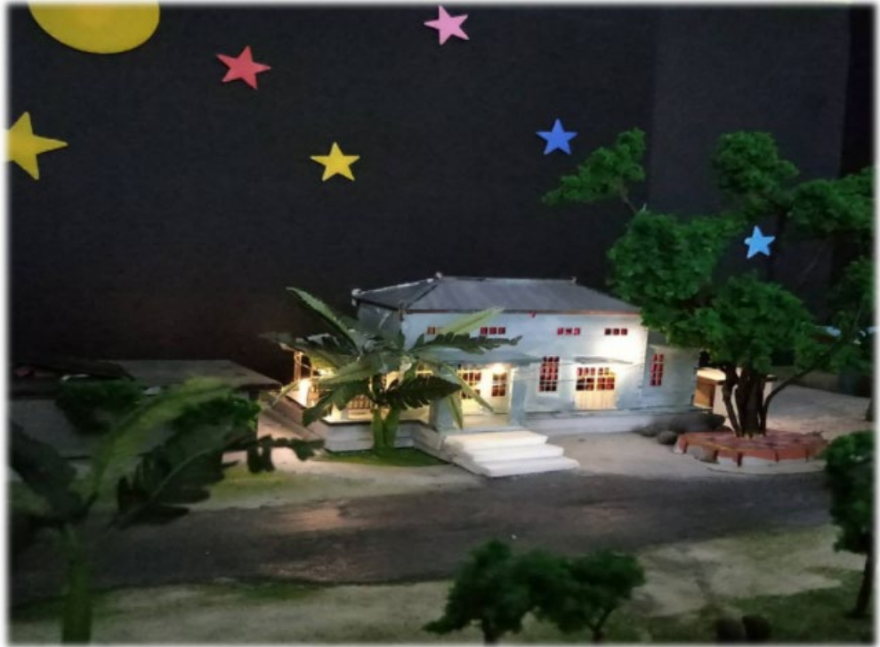
Picture 1. One of the LUOTS models made by a group of fifth graders.

1. Empathy: pupils are guided to conduct a field study in the local community and explore residents' needs.