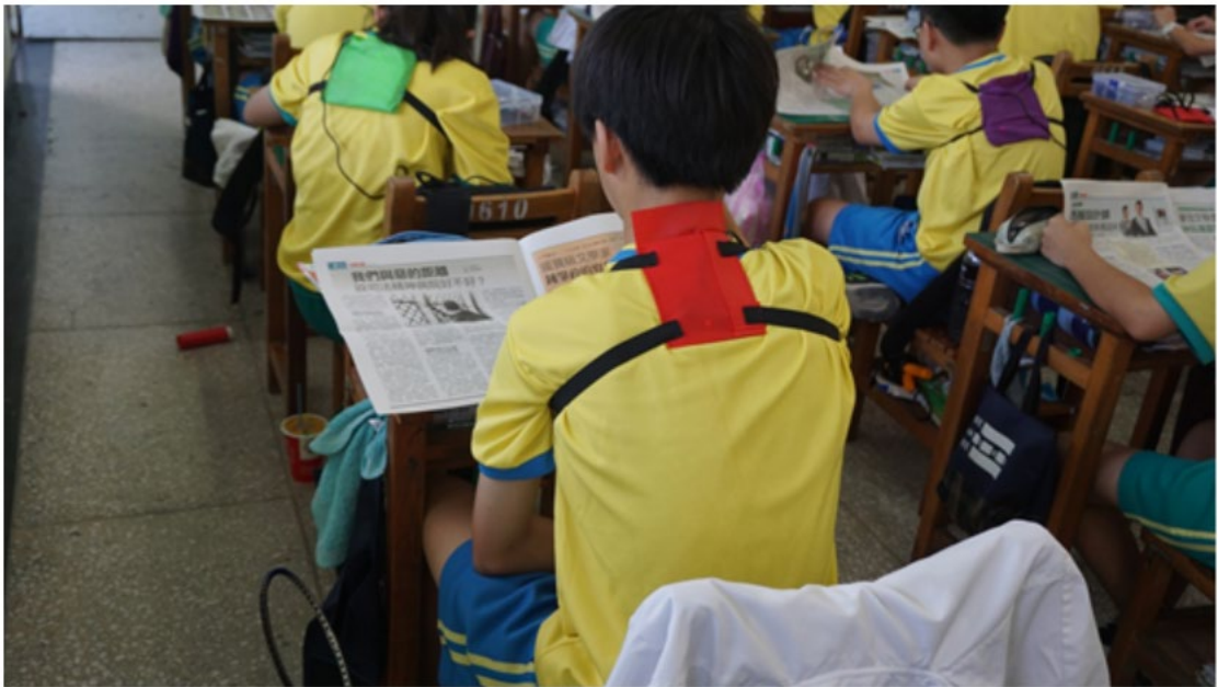
Picture 2. Three 8th graders wear Micro:bit enhanced devices to monitor sitting postures.

to monitor sitting postures and then help maintain correct sitting postures.