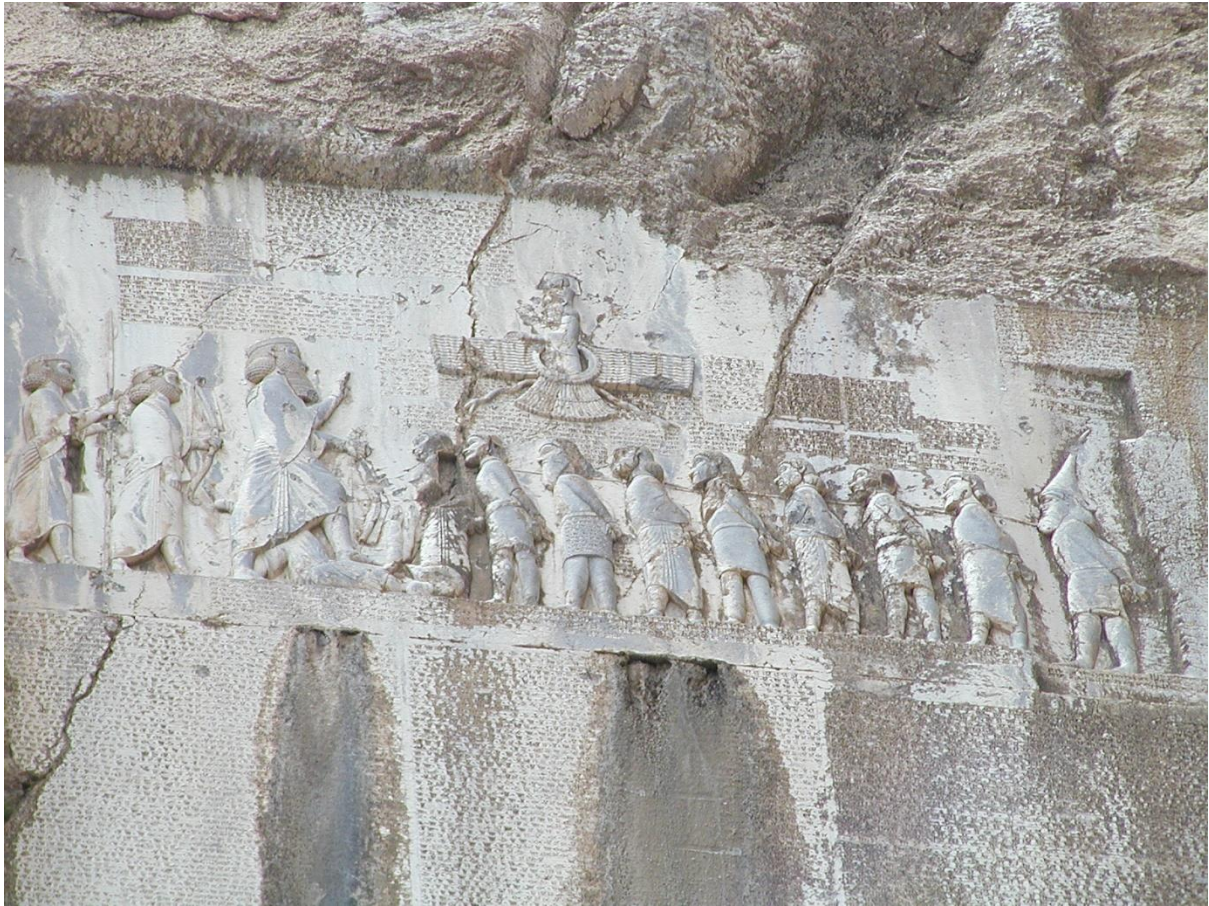
Figure 2. Part of Darius I’s trilingual inscriptions and relief at mount Bisitun.

inscriptions at mount Bisitun provides a visual “summary” of Darius’ victories. It depicts Darius as a crowned monarch, trampling a man beneath his feet, and standing in front of nine figures whose hands are bound behind their backs and whose necks are tied together with rope. Short cuneiform labels identify the prisoners with Gaumata and with the other (rebel) kings whom Darius described as having defeated. A figure in a winged disk, which hovers above the scene, grants Darius a ring, which is generally understood as a symbol of power. 116