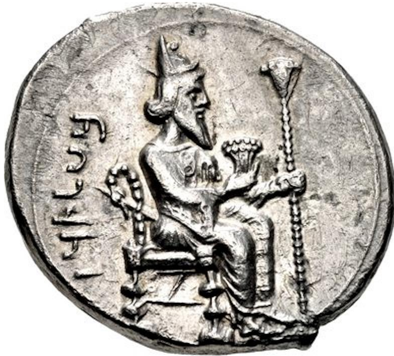
Figure 3. A Persian Period stater with the figure of an enthroned ruler who wears the Egyptian double crown.

above bear an Aramaic inscription that reads “Lord of Tarsus.” 153 If (some of) the coins of groups one to four can indeed be attributed to Artaxerxes III, it is possible that they should be interpreted as a type of victory coinage. After all, Artaxerxes III was the king who reconquered Egypt in ca. 343 BC, after it had been independent from the Persian Empire for several decades. The widely circulating artefacts – which featured Achaemenid rulers with Egyptian crowns and titles – could therefore have been created to celebrate the renewed Achaemenid hold on Egypt. 154