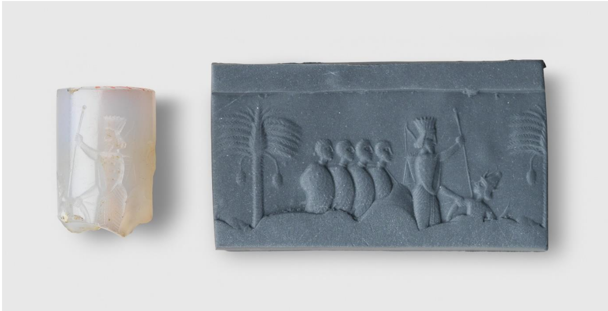
Figure 6. A broken cylinder seal shows a row of Egyptian prisoners, and a Persian figure spearing an Egyptian king.

does not depict fighting, it is not strictly a “combat seal.” It can instead be connected to seven other Achaemenid seals which focus on captives (of different ethnicities). 295 With or without combat, however, these Achaemenid “prisoner seals” are of particular interest because some of them invoke the row of bound rebel kings from the monumental relief at mount Bisitun.