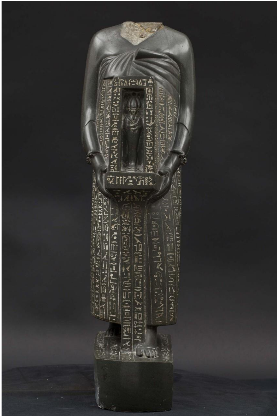
Figure 4. The inscribed statue of Udjahorresnet.