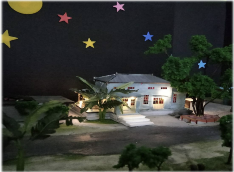
Picture 1. One of the LUOTS models made by a group of fifth graders.

1. Empathy: pupils are guided to conduct a field study in the local community and explore residents' needs.