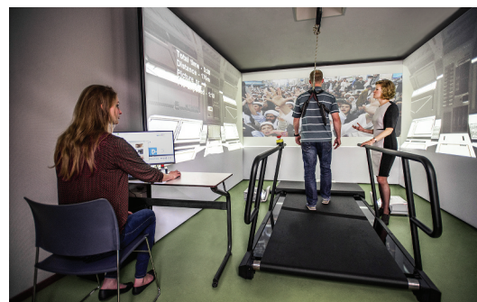
Figure 2. Image of the 3MDR set-up. The hardware included a dual-belt treadmill, a 180° projection on 3 screens by 3 projectors, and a surround sound system. The software consisted of a purpose-built virtual environment to walk in, personalized for each patient with images and music selected by patients. Participants wore a harness whilst on the treadmill for safety reasons. The therapist was standing alongside the veterans. A junior psychologist operated hardware and software.

3MDR is a manualized TFT. An extensive description of the theoretical framework and treatment protocol has been published (Van Gelderen et al., 2020; van Gelderen et al., 2018), and a summary description is provided here. A schematic overview of the 3MDR set-up is given in Figure 2. Patients selected pictures that strongly reminded them of their traumatic events. During 3MDR, patients walked on the treadmill