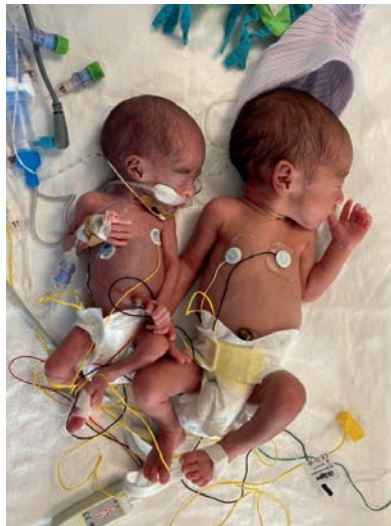
Figure 1. A MC twin pair with sFGR born at a gestational age of 30 weeks with respective birth weights of 500 grams (left) and 1350 grams (right). The picture was taken ten days after birth.

This report is written according to the STROBE guidelines 10 . The study was approved by the ethics committee of the Leiden University Medical Center (LUMC) and waived of the requirement for written informed consent due to its retrospective design. All consecutive live-born MC twin pairs born in the LUMC between 2010-2019 were eligible for inclusion. The LUMC is the national referral center for complicated MC twin pregnancies and fetal therapy in The Netherlands. The cases were reviewed for the presence of sFGR, defined as a birth weight discordance (BWD) \geq 20\% . BWD was calculated as: (\text{birth weight larger twin} - \text{birth weight smaller twin}) / \text{birth weight larger twin} \times 100\% 11 . All MC twins with sFGR were included. We excluded MC triplet pregnancies, cases with twin reversed arterial perfusion (TRAP) 12 and cases with other congenital abnormalities including, but not limited to heart defects, neural tube defects and chromosome abnormalities. Cases with twin anemia-polycythemia sequence (TAPS) 13 , twin-twin transfusion (TTTS) cases who underwent treatment other than laser coagulation (no treatment, amniocentesis, and/or selective reduction) and cases with incomplete laser (either recurrent TTTS or post-laser TAPS) were excluded as well due to their added adverse intrauterine circumstances.