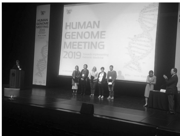
Fig. 2 Trainee awardees honored for their contributions at the HGM in Seoul