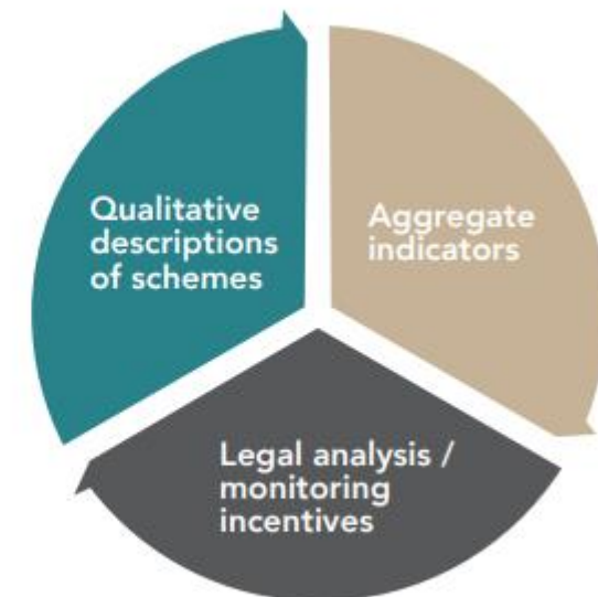
Figure 2 Three areas of risk assessment