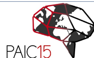
FIGURE 3 The PAIC15 scale