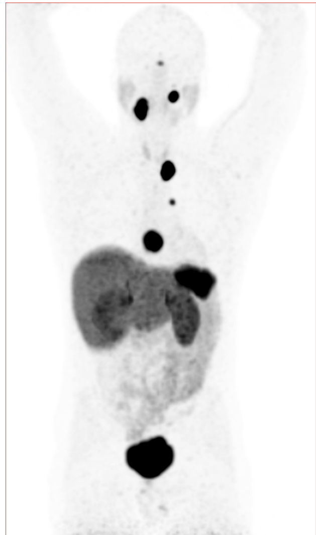
Figure 1. Gallium Ga 68-DOTATATE positron emission tomographic scan (coronal maximum intensity projection) demonstrates 5 somatostatin receptor-expressing paragangliomas located at the right carotid bifurcation, left vagal nerve, left carotid artery, aortopulmonary window, and posterior of the left cardiac atrium. Physiological tracer distribution is seen in the pituitary, salivary glands, thyroid, liver, adrenals, spleen, and in the urinary and gastrointestinal tract.

Less common sympathetic PGLs (sPGLs) in the thorax, abdomen, and pelvis, and pheochromocytomas are of sympathetic origin and may cause catecholamine hypersecretion. 3 Sudden death by stroke or cardiac arrest due to acute catecholamine excess has been