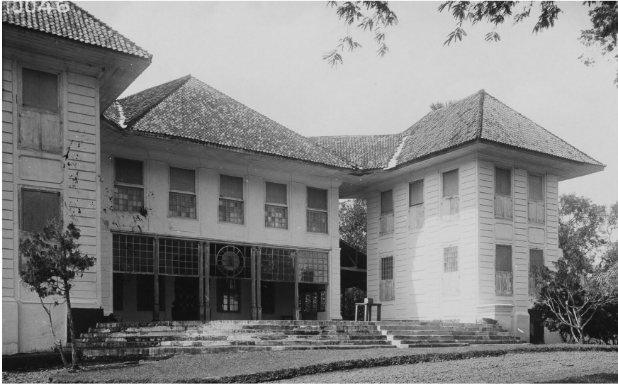
FIGURE 5 Back of Tanjung Timur or East Tandjoeng (also known as Groeneveld) in Meester Cornelis, Batavia, c. 1930, where Roorda van Eysinga met Willem van Riemsdijk

such moments, he resembled a government inspector rather than a preacher (cf. Huigen 2015:58).