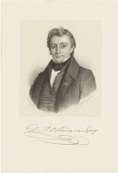
FIGURE 2 Portrait of Philippus Pieter Roorda van Eysinga (1796–1856), 1833 COLLECTION RIJKSMUSEUM AMSTERDAM, RP-P-OB-19.709