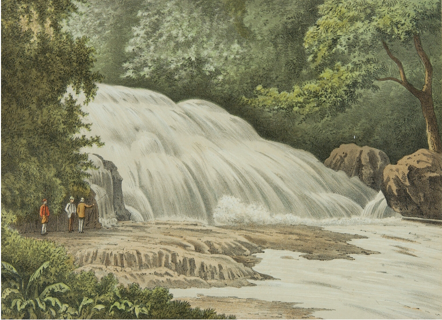
FIGURE 4 The waterfall of Maros, South Celebes/Sulawesi. Source: M.T.H. Perelaer, Het Kamerlid van Berkenstein in Nederlandsch-Indië (1888–1889), Vol. II, next to p. 154. Lithograph after an original water colour by J. Rappard COLLECTION NATIONAAL MUSEUM VAN WERELDCULTUREN, TM-H-3367

a considerable time. What diversity in creation, what a magnificent display of colour, what beauty in all of them.' No wonder that Roorda felt he was 'living in paradise' (Roorda van Eysinga 1830–1832, II:15, 19–20).