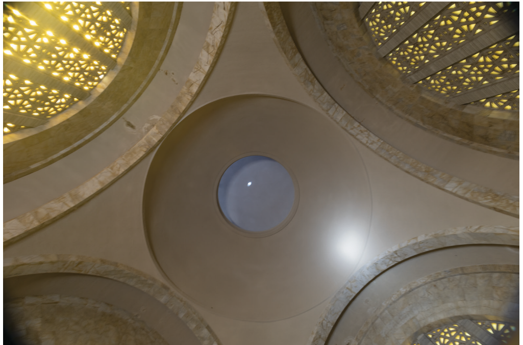
FIGURE N° 9

An early drawing reveals that he envisaged extending embellishment to the pendentives, one of which would represent a caravan of ox wagons. 19