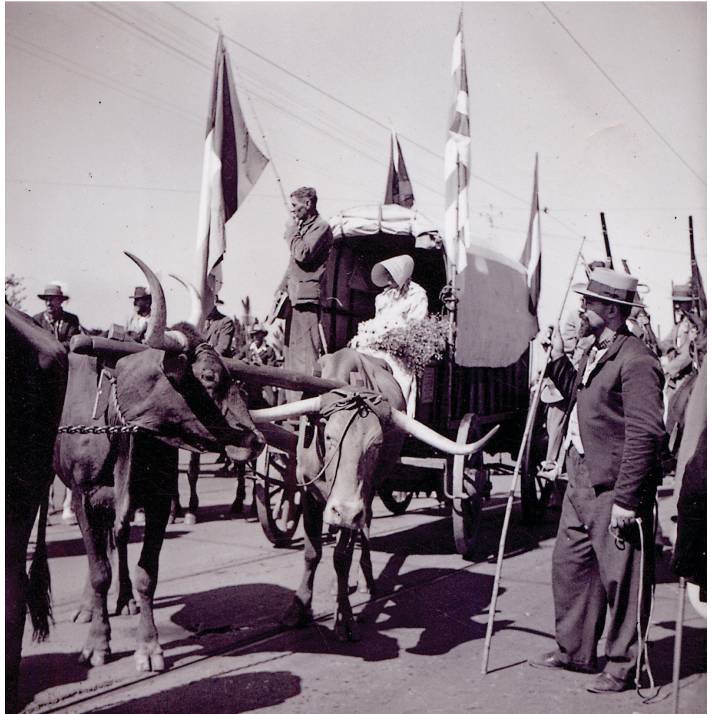
FIGURE Nº 5

welcomed at the university (Figure 5), where Moerdijk was Chair of Council, 14 and the Andries Pretorius wagon was invited to imprint its tracks in concrete (Figures 6 and 7). Placed in front of Merensky Library (Figure 8), which Moerdijk had recently completed, 15 this concrete slab also included Moerdijk's signature.