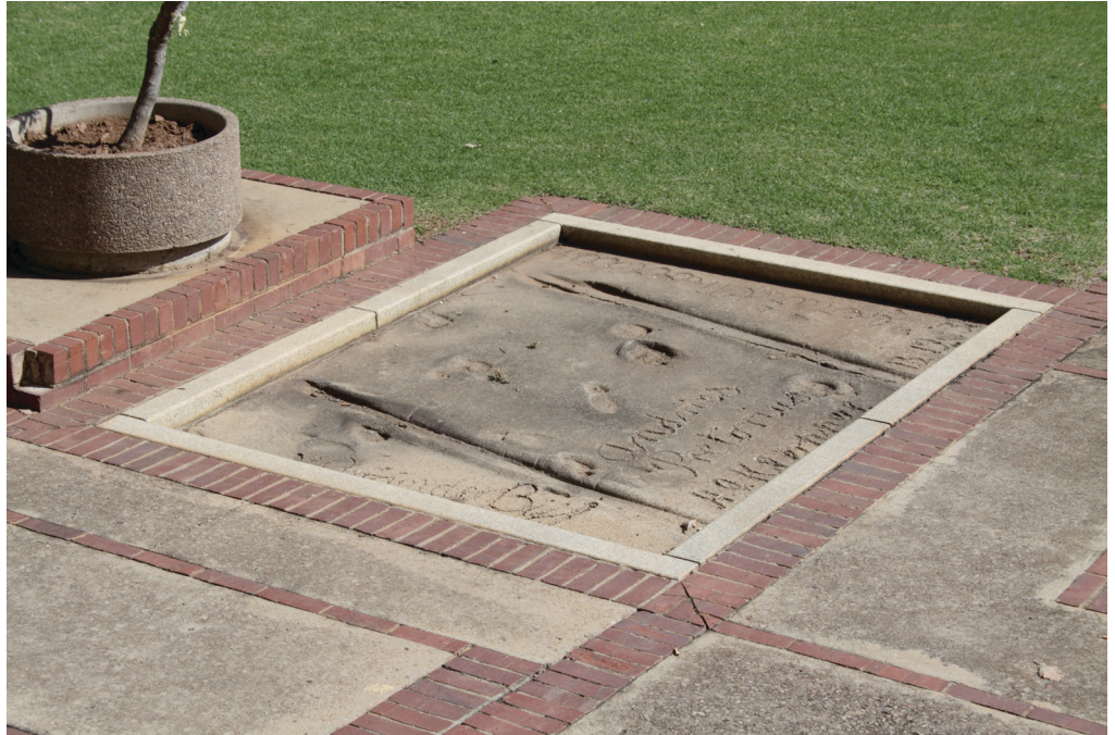
FIGURE Nº 7