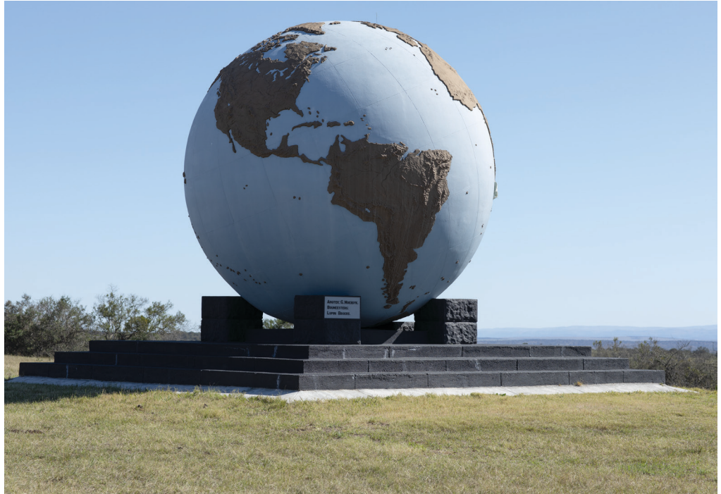
FIGURE Nº 16