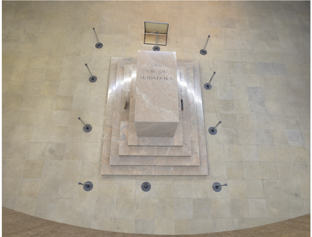
FIGURE Nº 10