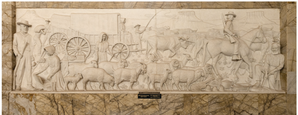
FIGURE Nº 13

within Afrikaner nationalist discourse. While its changing iterations and contradictions are too complex to unpack in any depth here, one broad point might be noted. Deborah Gaitskell and Elaine Unterhalter (1989:62) identify a change from a conception of the Volksmoeder as simply saintly and stoical in suffering in the years immediately following the South African War to a conception of motherhood as ‘far more active and mobilising’ – albeit in terms of her capacity to develop Afrikaner nationalist values in the home rather than in a public arena. Driving the ox-wagon, the home, across the wilderness in the KLM, the figure thus encompasses the idea of Afrikaner womanhood as a powerful domestic force.