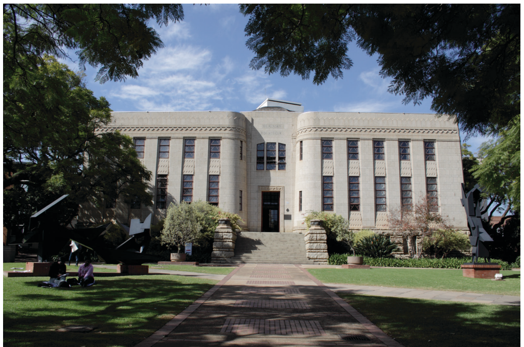
FIGURE Nº 8

Imprint of the Andries Pretorius ox-wagon outside the Merensky Library on 13 December 1938 surrounded by more recent paving.