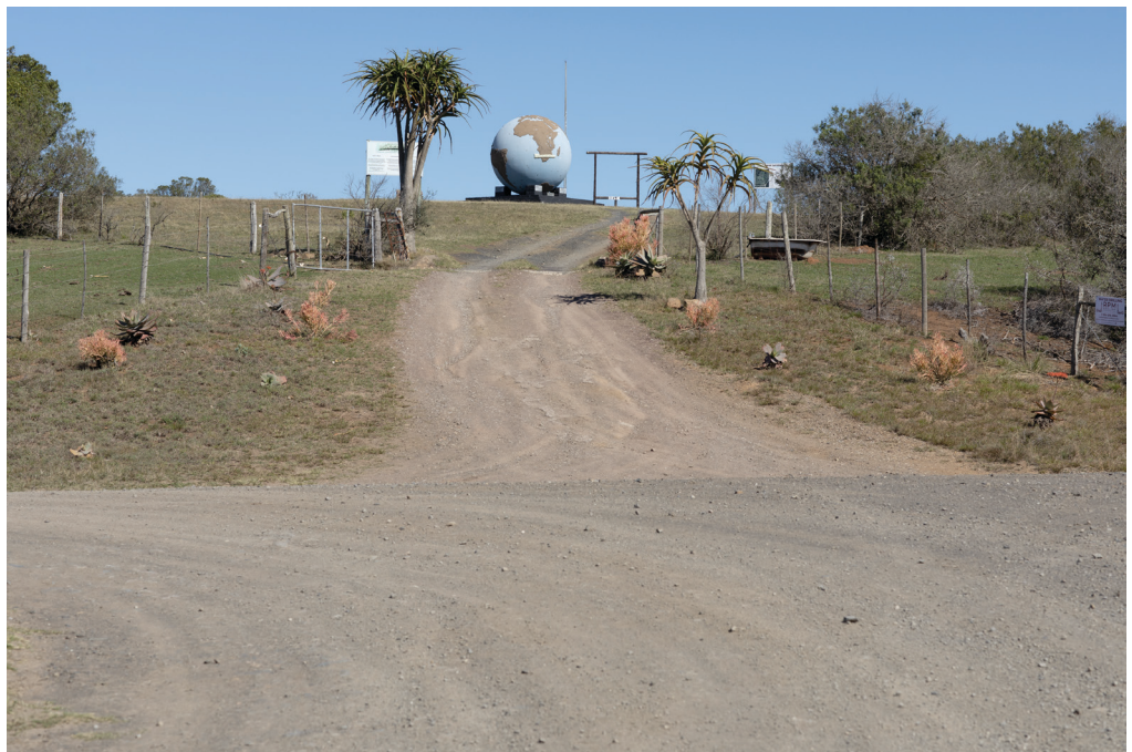
FIGURE Nº 1