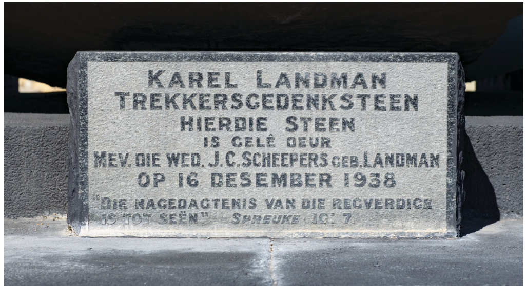
FIGURE N o 4