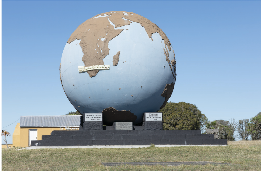
FIGURE Nº 2