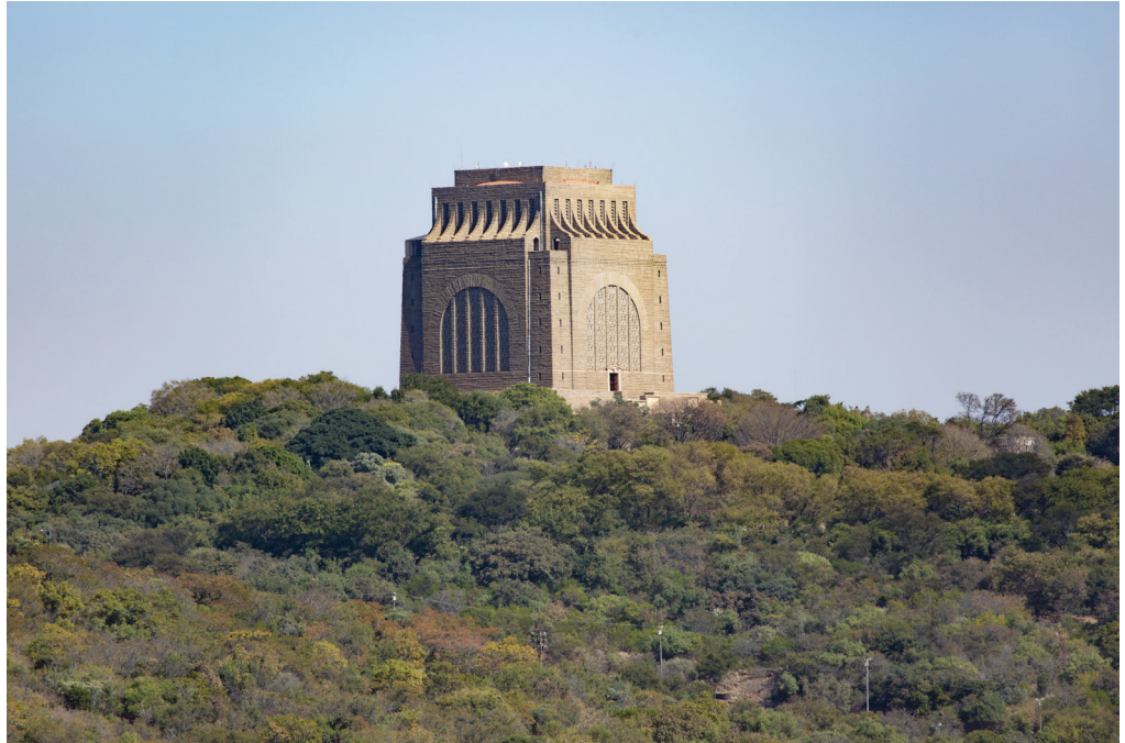
FIGURE Nº 12