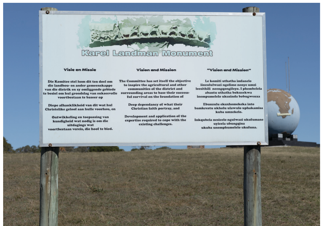
FIGURE N o 17

Unsurprisingly, however, interest in volksfees 23 occasions slowly tapered off over the decades. While the gathering on 16 December 2019 (just prior to the Covid pandemic) drew some 350 people to the site to listen to a range of speakers, this may have had much to do with a refurbishment and reconstruction of the globe, sponsored by the Rupert Foundation, that had taken place that year. 24 As with the Voortrekker Monument and the Taal Monument outside of Paarl, there have been efforts to configure the site of the KLM in such a way that it is accessible to a wider group of people than its original stakeholders. For example, it includes signage in not only Afrikaans but also English and isiXhosa (Figure 17). But as with those larger and better-known Afrikaner nationalist monuments, it sits somewhat uneasily in a contemporary South Africa where the values and beliefs which shaped it are at odds with an official rhetoric of emancipation (and nationalism) which are told through monuments built subsequent to 1994.