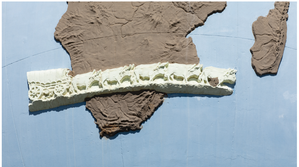
FIGURE Nº 3