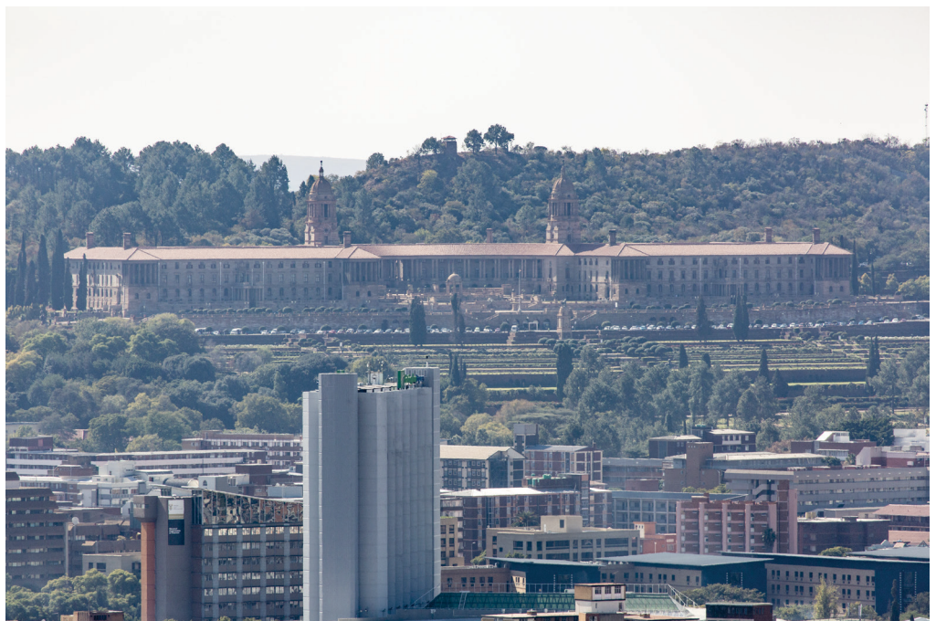
FIGURE Nº 11

Drawing a comparison between Baker's Union Buildings (Figure 11) and Moerdijk's Voortrekker Monument (Figure 12) which face each other on two koppies in Pretoria, Jooste observes that the former is 'soft centred' and horizontal, elegant and reticent. Symbolising 'a quietly confident system of government', it displays genteel civilisational progress (Glancey 1998:30 cited by Jooste 2001:77). The Voortrekker Monument, in contrast, stands stoutly like a block, expressing 'force, anger, struggle, dominance, subjugation and kragdadigheid ' (Jooste 2001:77). Moerdijk repudiates classicism associated with Baker's architecture and British imperialist understandings that underpinned it. Drawing on Modernism and Art Deco in the 1930s, Moerdijk's architecture looked to more 'authentic sources' – those from Great Zimbabwe, for instance – to make claims for an Afrikaner nationalist architecture (Freschi 2015:[Sp]). Jooste (2001:82) suggests that Moerdijk's monuments, which reflect the toil and the struggle of the Afrikaners, tend to be 'dark, depressing places devoid of humour and life'.