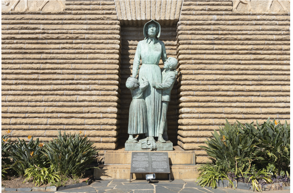
FIGURE N° 15