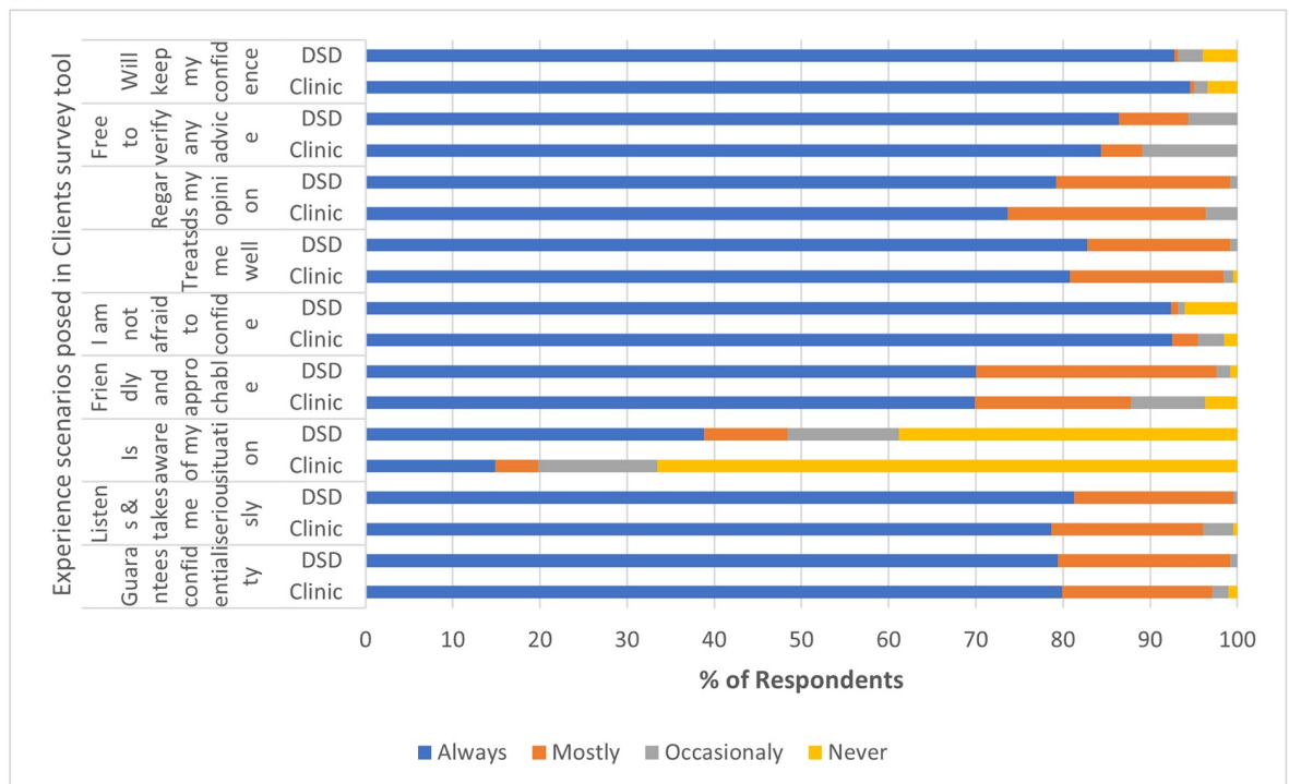
Fig 2. a: Process of care: Clients' perspective. b: Outcome of care: Clients' perspective.

https://doi.org/10.1371/journal.pone.0265307.g002