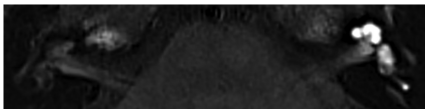
FIG 2. Axial 3D-FLAIR image 4 hours after intravenous gadolinium at the midcochlear level in a patient with unilateral left-sided sudden deafness, showing diffuse perilymphatic enhancement in the cochlea and vestibule.

equation in patients with unilateral definite MD. The other VAIEP group is considered a control group unless specifically stated otherwise. A P value < .05 was considered significant.