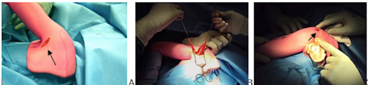
Fig. 2 This figure shows (A) the posterior approach to the posterior axillary line, (B) detachment of the latissimus dorsi and teres major tendons, and (C) the deltoid split for reattachment at the infraspinatus-supraspinatus footprint at the greater tuberosity of the humerus.

A prospective functional assessment of the shoulder was performed preoperatively and postoperatively at 6 weeks, 3 months, and annually thereafter, and included active and