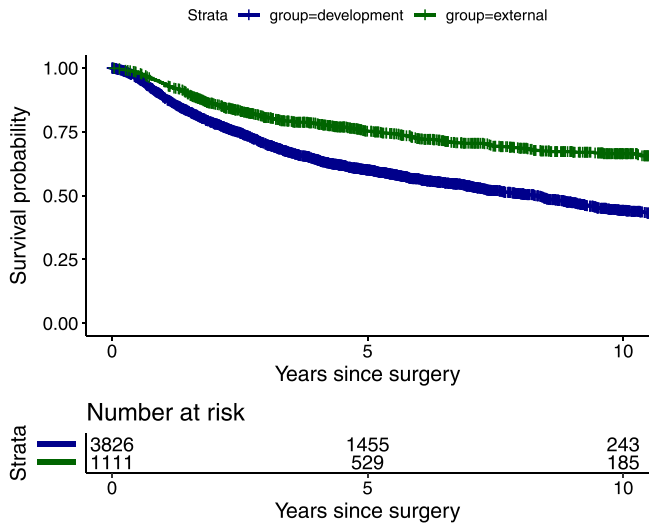
FIGURE 1 Kaplan–Meier curves for development and external cohort [Color figure can be viewed at wileyonlinelibrary.com ]

Groningen, Haukeland University Hospital, Helios Klinikum Berlin-Buch, MedUni Vienna, Vienna General Hospital, and the EORTC trial 62931, a randomized controlled trial which studied the effect of intensive adjuvant chemotherapy on several outcome measures.