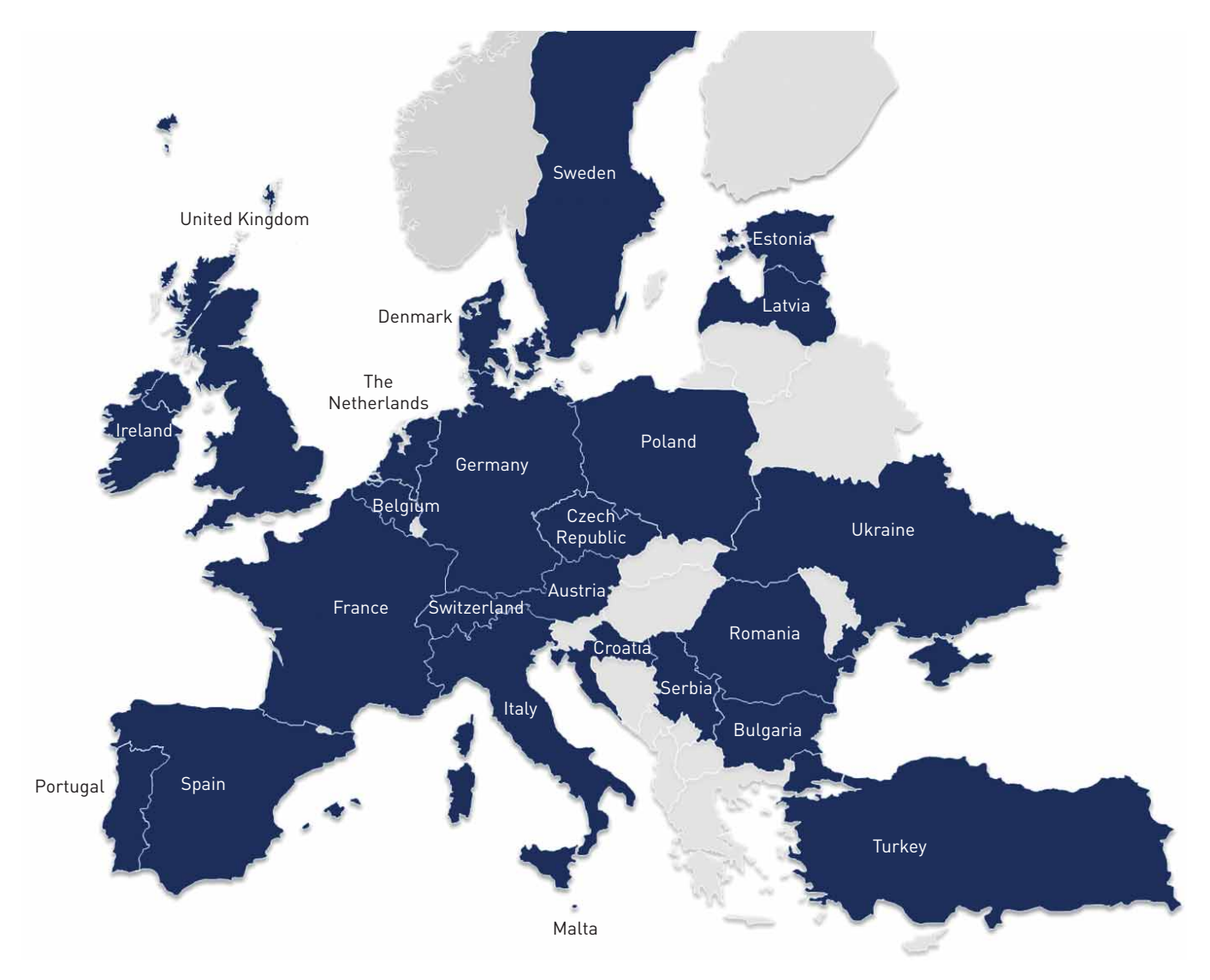
FIGURE 1 European countries in which study centres are located.

For patients who are lost to follow-up ( i.e. those patients whose status is unclear because they fail to appear for study visits without stating an intention to withdraw), the investigator should show "due diligence" (if allowed by national ethics committee standards) by documenting in the source documents steps taken to contact the patient, e.g. dates of telephone calls, registered letters, etc.