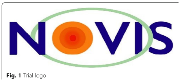
Fig. 1 Trial logo

The primary endpoint will be the final infarct volume on day 5 on MRI. If a patient recovers quickly and is