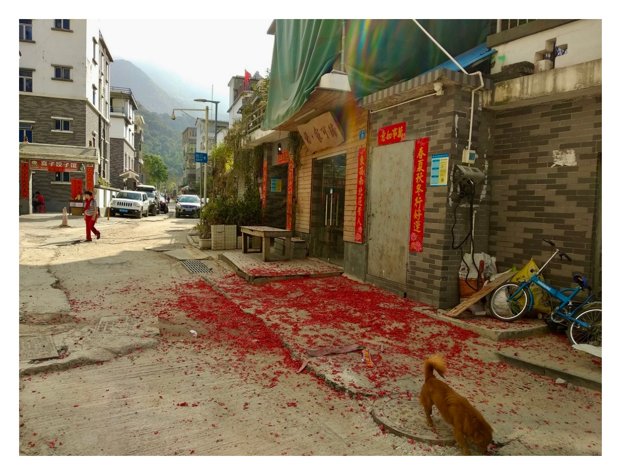
Figure 1 Wutong village streets.