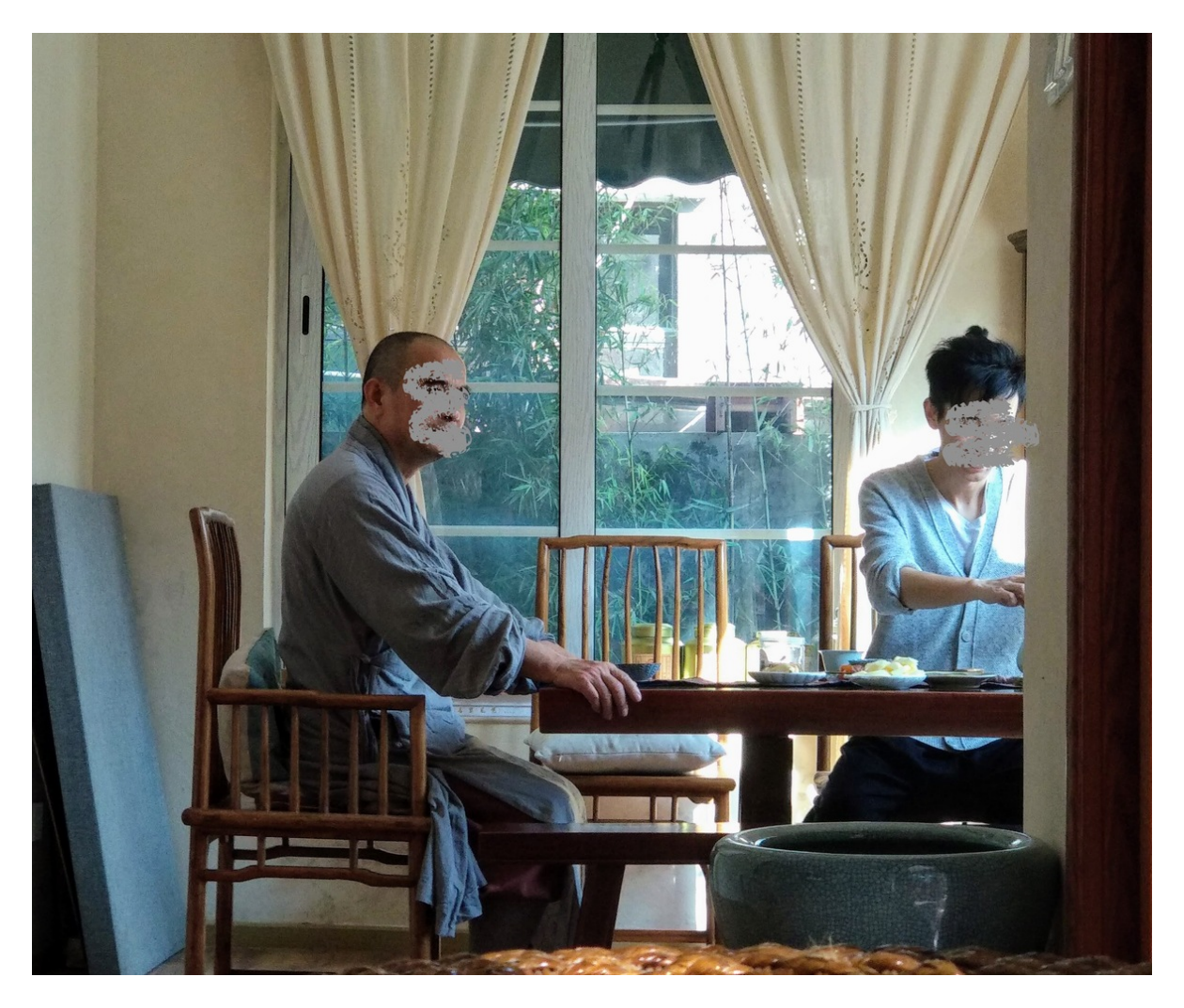
Figure 6 The Ru family tea house.

merable route choices that can be used interchangeably, while each combination provides for a different set of possible social, spatial and economic interaction" (Kochan 2015, 935).