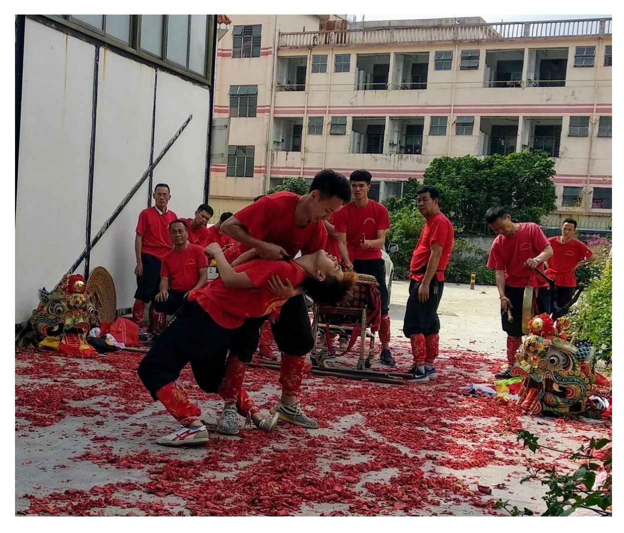
Figure 3 Hakka traditional martial art.