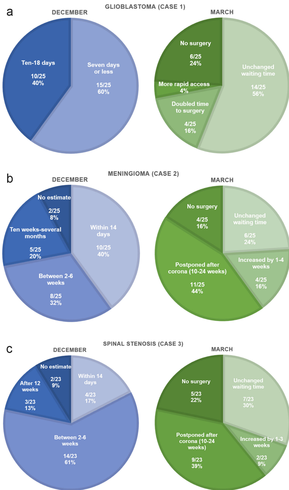
Fig. 2 a–c Expected time to surgery in December and March for the elective patients 1–3