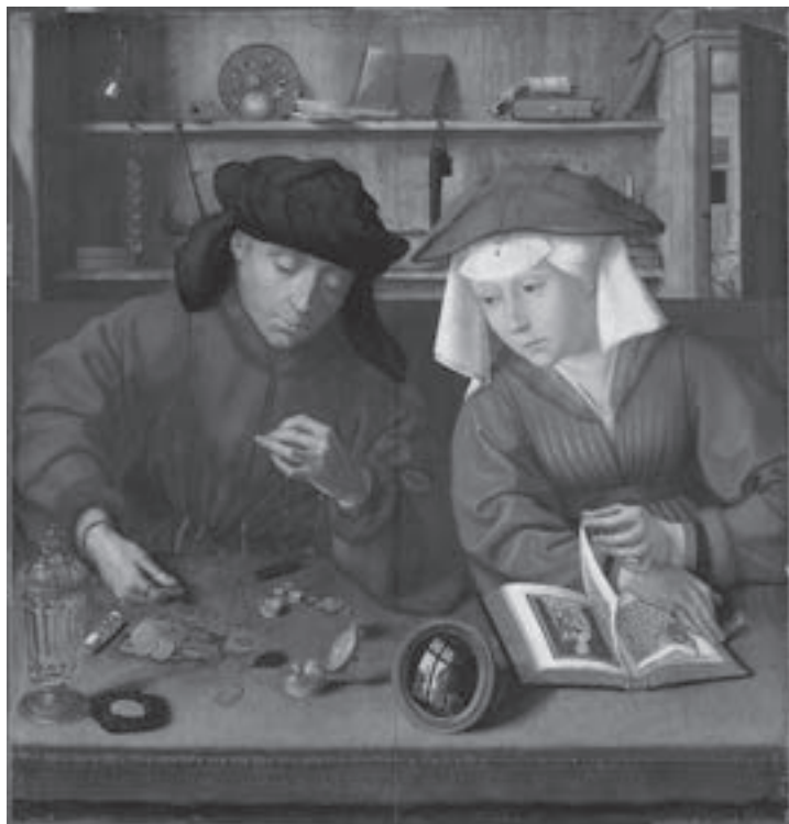
Fig. 4. Quentin Metsys, The Moneylender and His Wife , Paris, Musée du Louvre. 1514.

a chaplet or the wreathing of a garland through prayer sequences. 96 The insertion of the image could indicate that the text was indeed directed at ‘devout people’ in the widest possible sense, even at those who never set their hand on a distaff. Here, the allegory seems to prevail and break free of the materiality and act of spinning.