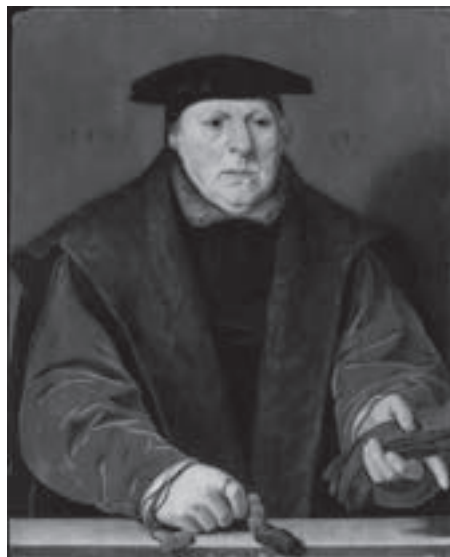
Fig. 6. Portrait of a Man with a Rosary, copy after Jan Cornelisz Vermeyen, New York, The Metropolitan Museum of Art, The Jack and Belle Linsky Collection, 1982. 1545.