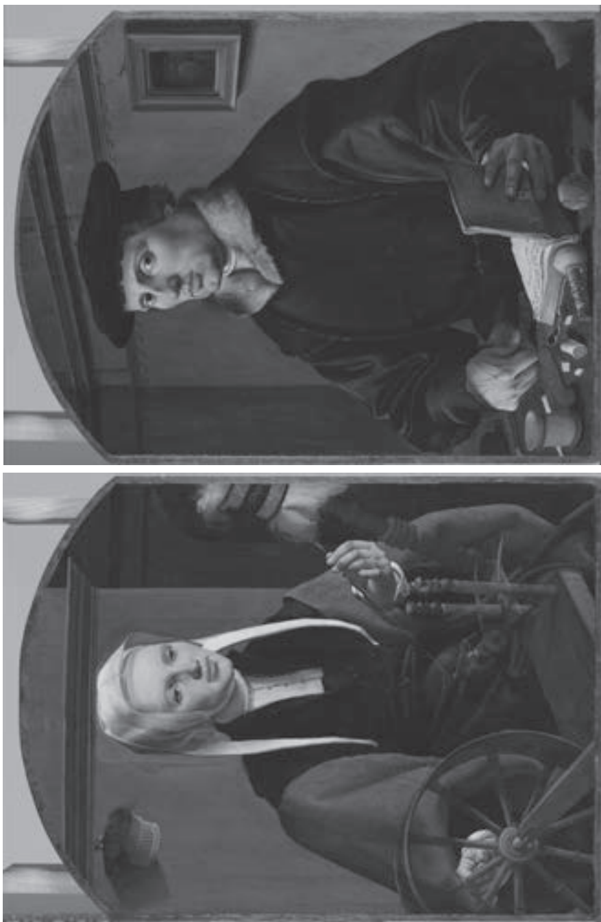
Fig. 1. Maarten van Heemskerck, Portraits of a Man and Woman , possibly Anna Coddle and Pieter Gerritsz. Bicker , Amsterdam Rijksmuseum. 1529.