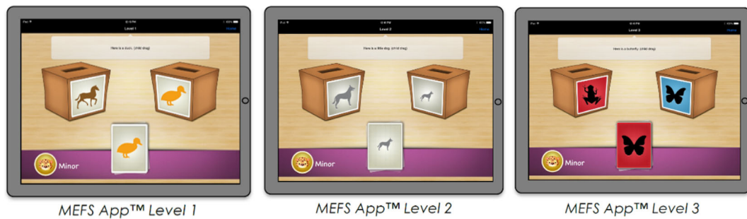
FIGURE 1 First three levels of the MEFS App™. Children are instructed to sort cards into boxes based on a specific rule that increases in difficulty when a child progresses through the levels (displayed here: 1: horses versus ducks, 2: large versus small, 3: red versus blue).

algorithm that takes both accuracy and response time into account, with higher scores reflecting better executive function skills. In analyses, either raw or standardized scores were used (see Section 2.4). Standardized scores were calculated differently depending on the recruitment site. For children from the Netherlands, scores from the current control group were used to calculate standardized scores (percentile scores). For children from the United States, scores from the general population were provided by the MEFS-app and converted into standardized scores (percentile scores).