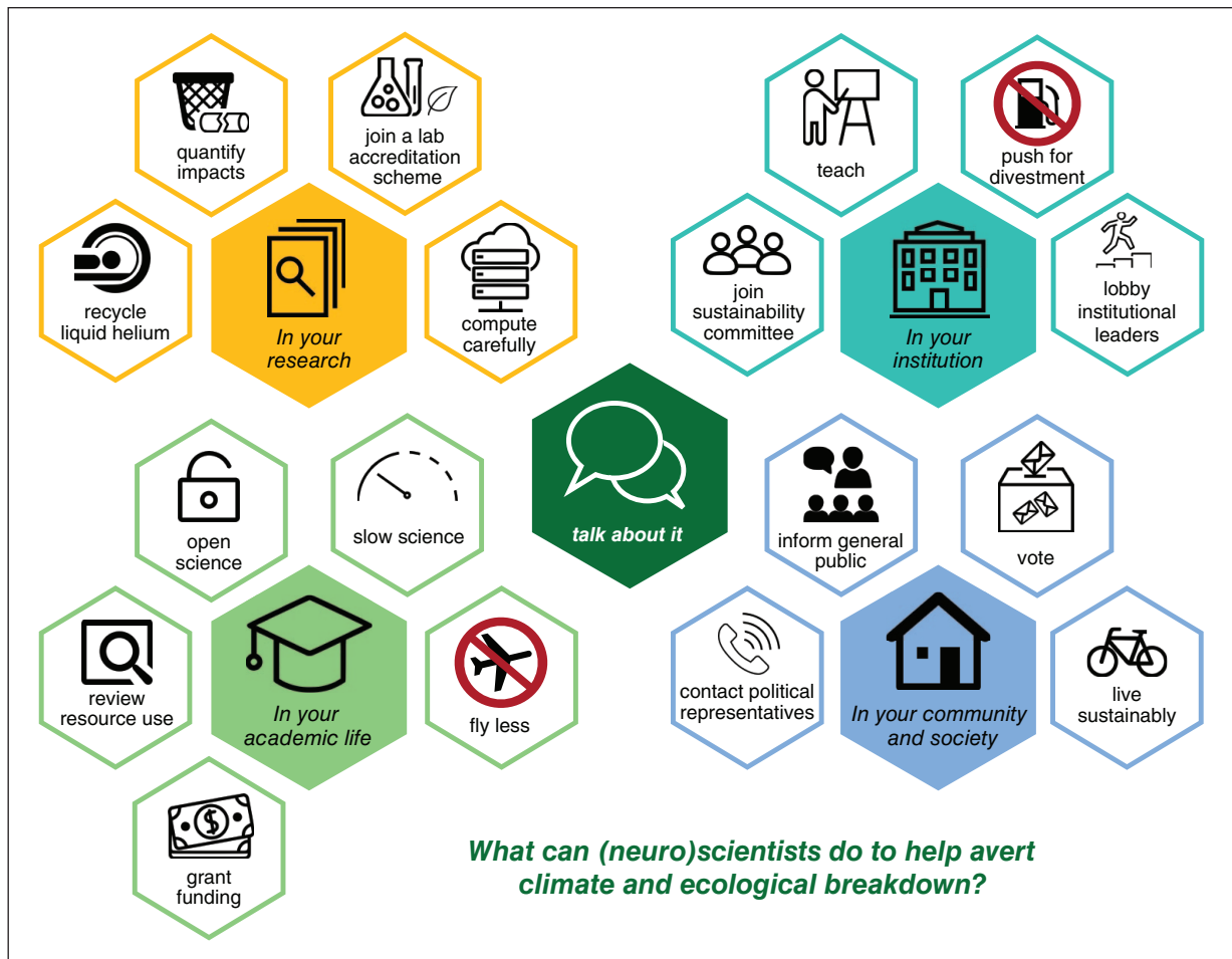
Figure 1. Ways in which (neuro)scientists can act on the climate and ecological emergencies. We distinguish four areas of influence and a non-exhaustive list of specific actions, each of which is discussed in greater detail in the article.