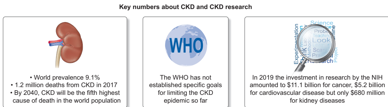
FIGURE 1: Key numbers relating to CKD and CKD research.

Scientific discoveries are a product of the intellectual capital of society. Funding is fundamental to nurture such capital. For medicine, decisions about research funding are extraordinarily complex because financially demanding resources need to be allocated for the production of knowledge related to human health at all levels, from basic science to clinical science and prevention (Box 2). In 2012, $119 billion was spent on medical research in the USA and $82 billion in European countries, and most of this investment came from industry, 59% in the USA