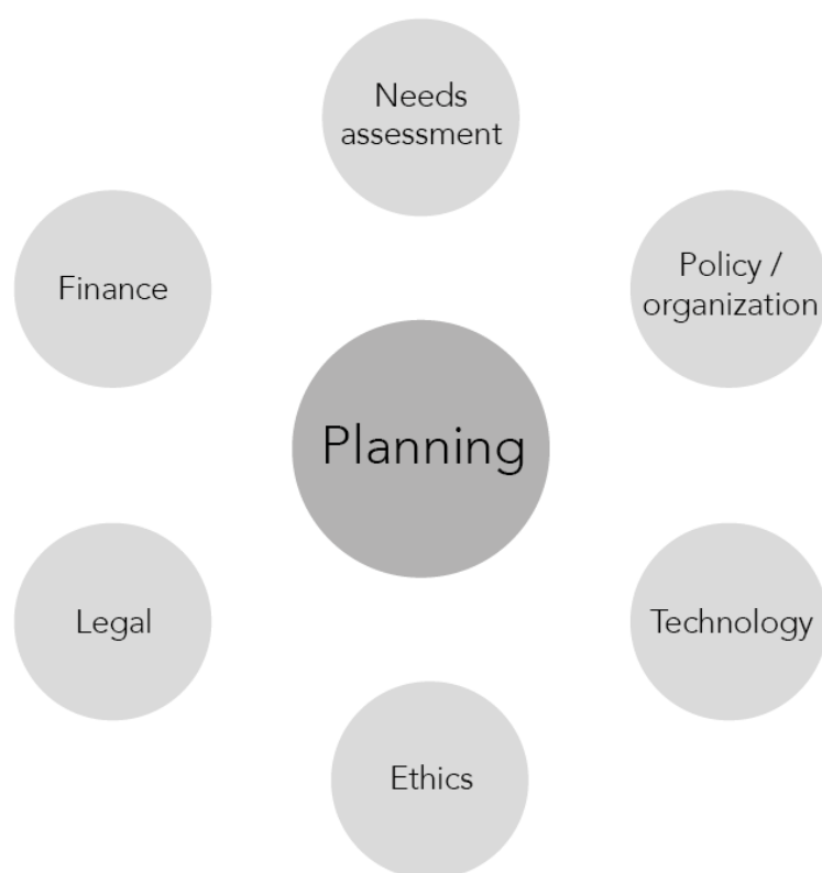
Figure 2. eHealth project progress aspects.