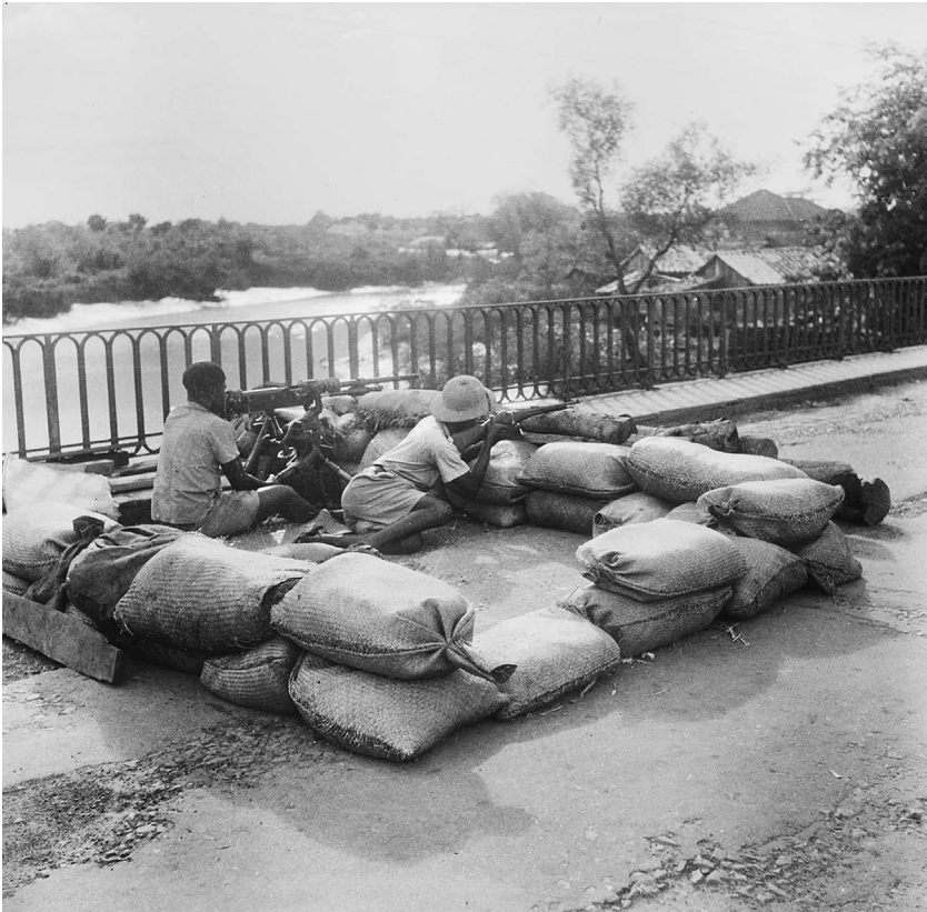
FIGURE 4.1 Security forces in French service guard a bridge over the Saigon River during the early revolutionary period in Indochina, October 1945.

had nervously and passively observed events. 25 Heeding the pleas for intervention from the local settler population, Paris kicked its recolonization campaign into high gear during the last week of September 1945. “We must demonstrate our might and our resolve to use it” to convince “indigenous public opinion that France has no intent to renounce either its obligations or its rights,” French military authorities noted. Displays of military strength were deemed essential in the countryside, since peasants were “gullible, easy to manipulate, and always ready to cower before those they judge to be mightiest.” 26 Independence was not an option, because it was deemed that, for the time being, Vietnamese lacked the maturity to rule themselves. 27 Beyond these considerations, the use of force was vital “for the sake of our prestige,” French military authorities concluded. 28