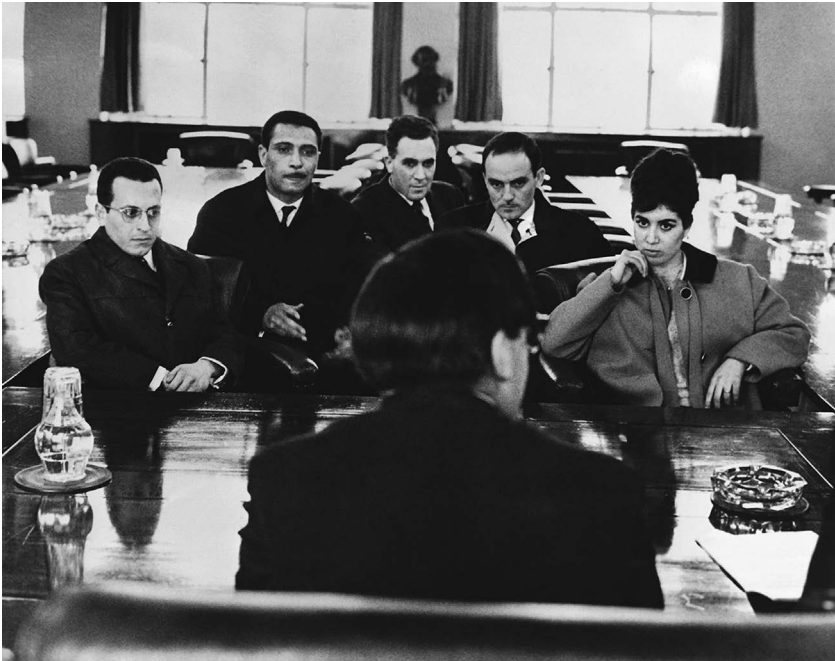
FIGURE 5.1 Djamila Boupacha, a member of the FLN and victim of rape during the Algerian War of Independence, visits the Labour Party headquarters in London in the company of other Algerian functionaries, March 14, 1963.

Statistically, this kind of comparison is largely meaningless. Rape has always been underreported and under-prosecuted, both in civilian societies and in theaters of war. In wartime, bystanders, mostly fellow soldiers, rarely break the code of silence about offenses they have witnessed. The silence on the side of the victims can be attributed to societal norms and pressure not to undermine the “honor” of the family. 6 A comparison between the Indonesian and Algerian context becomes meaningful if we focus on the visibility of rape as a form of violence committed by the French and Dutch armies. One of the biggest scandals