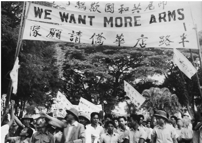
FIGURE 3.1 During a large demonstration in Medan, Sumatra, in September 1947, Chinese protesters carry a banner demanding the means to protect themselves from the violence by Indonesian forces against their minority community. Their use of English shows they aim at an international audience.

Through our microdynamics-of-violence lens, we can see that, locally, these violence workers behaved in ways inimical to colonial interests. In this connection, we look at two quite different militia groups in Indonesia: plantation guards (PG) and the ethnic Chinese paramilitary group, the Pao An Tui (PAT). Local enforcers' actions and the motives behind them illuminate that murky area where European domination stops and colonized cooperation starts. Dutch reliance on locally recruited forces increased dramatically as a function of the additional Indonesian territory brought under nominal colonial control following the first "police action" of July 1947. Still, Indonesian Republican forces compelled Dutch units to concentrate in key areas, so General Simon Spoor's command chose to arm auxiliary formations in Java and Sumatra to patrol plantations, gather intelligence, and, in the case of the PAT, protect Chinese communities. The twenty thousand or so plantation laborers formed into armed cadres are prime examples of violence workers. Armed by the colonial state to police interior borderlands, they retained some independence of action by either remaining neutral or compromising with insurgents. Plantation guards, who generally were reluctant to engage in violence, are at one end of the violence