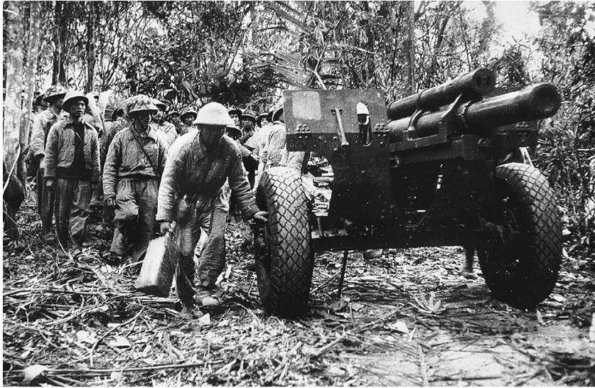
FIGURE 6.1 Vietminh troops move Chinese-built artillery in preparation for the battle of Dien Bien Phu, 1954. The Indochina War was the only war of decolonization in which Western forces were locally matched or trumped in heavy military equipment on the ground.

In Indonesia, the battle of Surabaya taught the belligerents important lessons early in the conflict and paved the way for a different outcome. After the Japanese capitulation on 15 August 1945, followed two days later by the Indonesian Proclamation of Independence, British-Indian troops temporarily occupied several so-called key areas in the archipelago. In Surabaya in November 1945 the heaviest battle of the entire war would take place, in which artillery, air power, tanks, and naval gunfire all played an important part. During the initial stages of the fighting, inadequately armed British-Indian units were overrun by numerically superior Indonesian fighters. British losses ran into the hundreds. After Brigadier Mallaby, commander of the 49th Indian Infantry Brigade, was killed by insurgents on October 30, General Sir Philip Christison (commander of the Indonesian theater) famously threatened “to bring the whole weight of my sea, land and air forces and all the weapons of modern war against them until they are crushed,” a warning that was acted on ten days later, on November 10. 37 The British opened with a naval bombardment by three destroyers, followed by a bombing campaign from the air by RAF Thunderbolts and Mosquitos and from land by the Royal Artillery. After weeks of heavy fighting and thousands of Indonesian