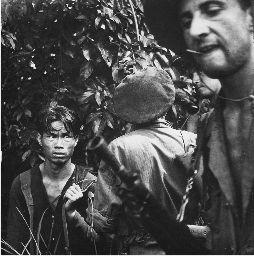
FIGURE 7.1 The original 1953 US Information Agency caption with this photo said, “The French Foreign Legion is playing the major combat role in the war against the Vietminh. Here a red-suspect has been found hiding in the jungle and is now being questioned by the advance patrol, who caught him.”

innovation involved technical and tactical military solutions, although there were some experiments with improved intelligence gathering and counter-guerilla operations through the use of local allies. 32