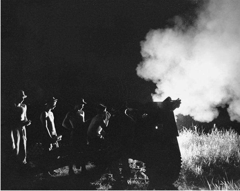
FIGURE 7.3 As part of the Commonwealth war effort during the Malayan Emergency, Australian gunners fire their twenty-five-pounder field gun during a nightly shoot against communist insurgent camps or trails in the jungle. (Australian War Memorial, HOB/56/0658/MC)

In Indonesia, the final Dutch tactical publication of the war likewise explicitly stressed the need for heavy weapons to free up manpower (but warned against ammunition wastage because of logistical problems—note that the issue of “collateral damage” did not feature in this warning). 84 In Indochina, Indonesia, Algeria, and to a lesser extent in Malaya, artillery support to the infantry was frequently given and even more often requested. This was also true of air support. 85