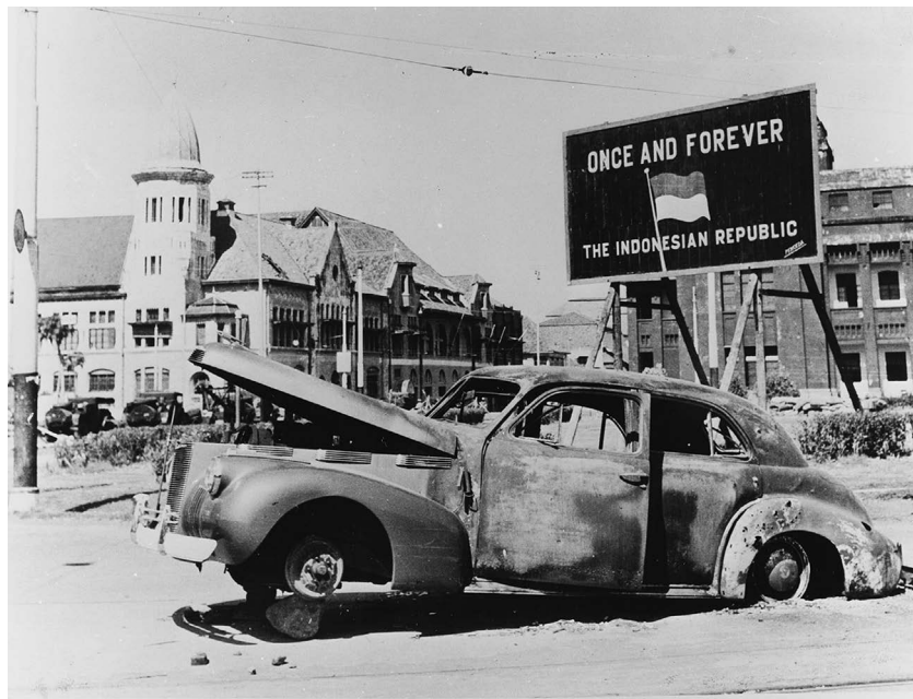
FIGURE 4.2 The burned-out car of British brigadier A. W. S. Mallaby on the spot where he was killed in Surabaya during the partial British occupation of Java, 30 October 1945. This incident further escalated the urban battle between British troops and Indonesian forces in the key city.

would last for three weeks. British determination to punish and destroy the enemy met revolutionary fury and the determination to defend Surabaya at all costs. The battle took the lives of thousands of Indonesian fighters and noncombatants, destroyed most of their military equipment, and devastated the city of Surabaya. Ninety percent of the population fled the city. 66 The battle of Surabaya showed similarities to the French attack on Haiphong one year later. Both cities were destroyed, but the French and British had different motives and drew different conclusions. Whereas the French decided to regain colonial control and saw Haiphong as an example to be replicated, the British had their revenge and were even more eager to leave Java and Sumatra as soon as possible. The restoration of Dutch colonial authority was never a priority to them. The British were only able to leave Java in November 1946 owing to the cumbersome Dutch-Indonesian negotiations and the slow arrival of Dutch troops after they were allowed back starting in March 1946.