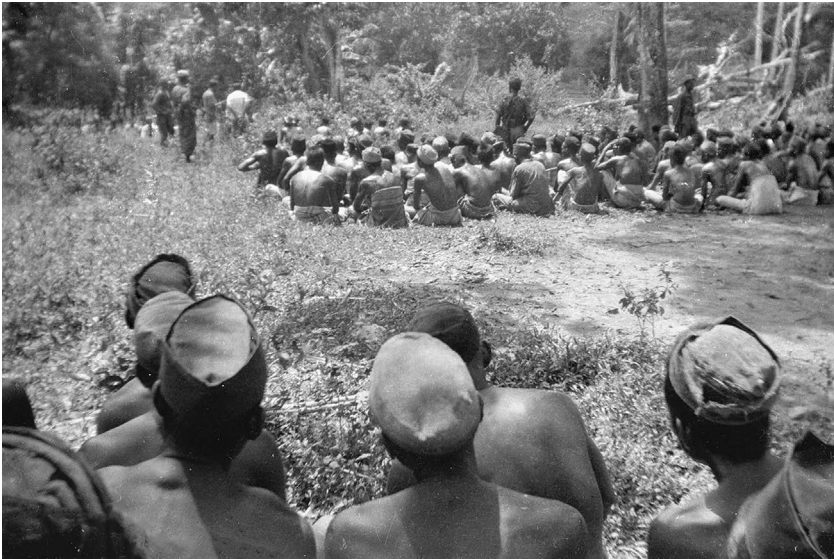
FIGURE 4.3 Indonesian villagers are forced to watch as commandos from Captain Raymond Westerling’s Depot Speciale Troepen (DST) execute approximately twenty men from Salomoni and surrounding villages on South Sulawesi. The Dutch captain, who had a leading role in fighting the local insurgency, was not personally in command of this action on 12 February 1947.