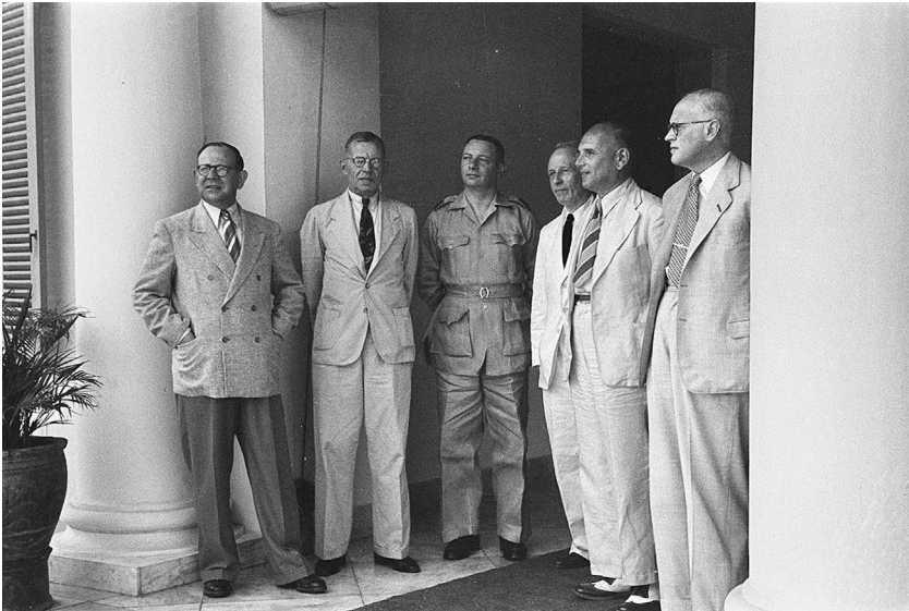
FIGURE 2.2 Netherlands forces commander General Simon Spoor ( center) receives parliamentary leaders from The Hague at his headquarters in Jakarta in December 1948. Spoor was frequently informed of abuse by his forces, but he and Dutch policy makers mostly frustrated prosecution of those responsible and were themselves never held accountable.