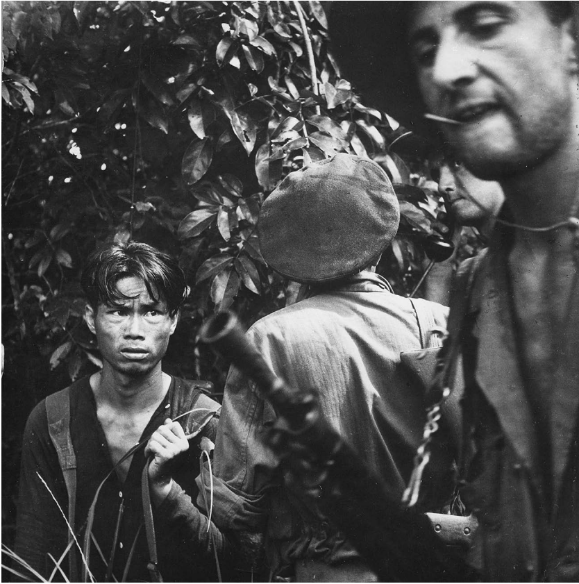
FIGURE 7.1 The original 1953 US Information Agency caption with this photo said, “The French Foreign Legion is playing the major combat role in the war against the Vietminh. Here a red-suspect has been found hiding in the jungle and is now being questioned by the advance patrol, who caught him.”

innovation involved technical and tactical military solutions, although there were some experiments with improved intelligence gathering and counter-guerrilla operations through the use of local allies. 32