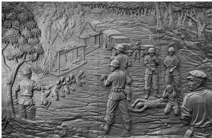
FIGURE 8.2 An Indonesian monument in Balongsari includes a sculpture depicting the December 9, 1947, massacre by Dutch army forces in the town formerly known as Rawagede. Estimates of the number of men executed or killed under other circumstances on that day are still heavily contested but mostly vary from 150 in official Dutch reports to 431 according to Indonesian sources. On September 15, 2011, a civil court in the Netherlands ruled that the Dutch state had to pay indemnities to nine widows of the victims.

by several TV documentaries of the time. Les années algériennes by Bernard Favre and La guerre sans nom by Bertrand Tavernier recorded the words of civilians and soldiers, who recounted the war on the ground. Violence was not excluded from their narratives, but it was not the central theme, nor was violence limited to acts committed by the French. This was also the period when France officially recognized the war as such. In 1987, all the veterans associations gathered in what they called a “united front” to lobby for a better recognition of their injuries and traumas and an official changing of label from “the maintenance of order operations” to “the war.” In 1999 Parliament voted unanimously to change the name, and in 2002 a national monument dedicated to the soldiers and fighters who lost their lives in Algeria was unveiled in Paris for the fortieth anniversary of the end of the war.