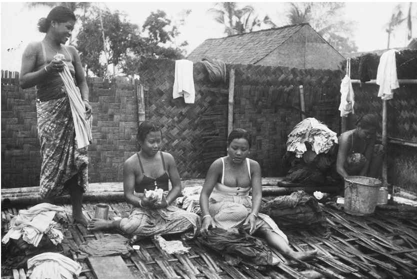
FIGURE 5.2 Four “ baboes ” wash uniforms inside a military encampment in 1949. In Indonesia, unlike in Algeria, such local female workers were common on military bases and smaller posts during colonial times. Dutch military personnel often had intimate relations with these women, but sexual abuse also occurred in this setting.

produced by former members of a Dutch army unit in 1996, one veteran recalls being encouraged by fellow soldiers to have sex with a clearly non-consenting baboe : “At a certain moment, they were getting me drunk or half drunk, and started to offer me one of their many baboes , who luckily said, Tida mau, toean (which means, I don’t want to, sir).” 22 In both these accounts, baboes are not considered individual women with agency, but rather as part of the services of a barracks. In fact, baboes often had the additional informal “task” of providing “sexual relief” to the unit. Local commanders would make such arrangements to prevent their men from contracting venereal diseases when visiting prostitutes (in Algeria, the French army formally created military brothels for the same purpose of “sexual release”). In a diary account, H. van Hoorn describes traveling a long way with a group of men and lodging as guests at an army logistical base in Banjoewangi: “[We] went to town to have some food and went to bed early. We had traveled for 270 miles. At night we were woken by a lot of noise and ado. It turned out to be R. who was after the baboes of our hosts. This is really impolite; one should not behave this way as guest.” 23 This is not to say that all sexual contacts between baboes and Dutch military personnel could be characterized as