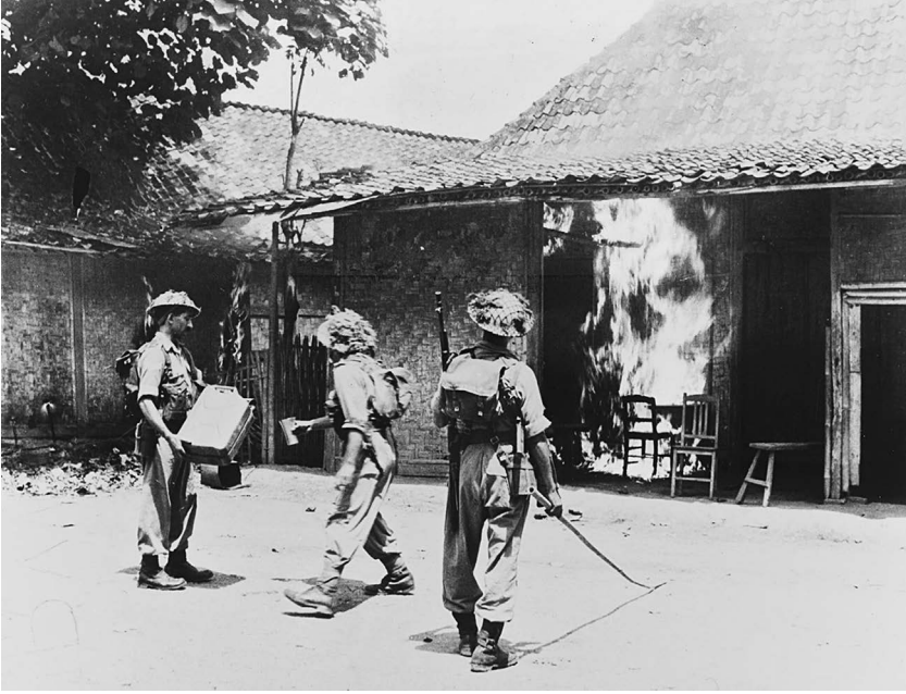
FIGURE 1.1 During the partial Allied occupation of Java and Sumatra, British-Indian troops burn down houses in Bekasi on 13 December 1945. Large parts of the town were destroyed as a collective punishment for the brutal murder of five members of the Royal Air Force and twenty British-Indian riflemen whose Dakota aircraft crash-landed near the town.

rather than the stubborn but weakening Dutch allies formed the best antidote against communism in Southeast Asia. 7 Ignoring the writing on the wall, the Netherlands nevertheless launched yet another major offensive in December 1948—the second “police action”—this time aimed at “decapitating” the Republic by conquering its capital and arresting its political and military leaders. This led to ever more intense guerrilla warfare, a similar faltering counterinsurgency campaign by the overstretched Dutch army, atrocities on all sides, and unprecedented international condemnation of the war-weary Dutch. All these factors together led to a speedy negotiated withdrawal in late 1949 and the formal transfer of sovereignty on 27 December 1949.