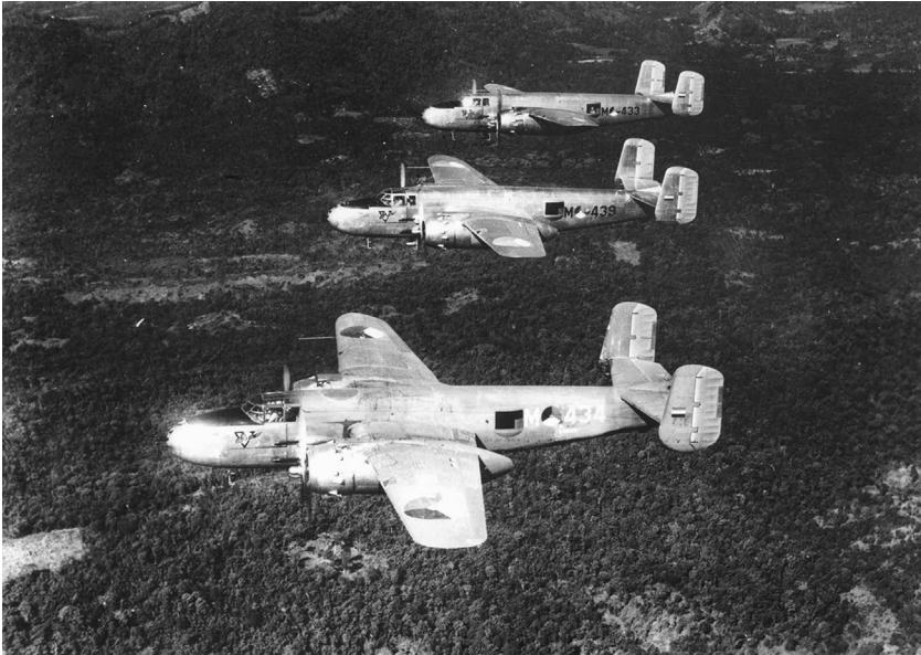
FIGURE 6.2 A formation of American-built B-25 medium bombers in service with the Royal Netherlands East Indies Army Air Force. The airplanes in this 1946 photo have been modified with extra heavy machine guns to strafe ground targets.

some infantry battalions, laying hands on prewar KNIL guns, constructed three “illegal artillery” units on their own, which supported their battalions during Operation Product. When the troop buildup was complete, the Dutch forces in Indonesia had a total of around 150 field guns.