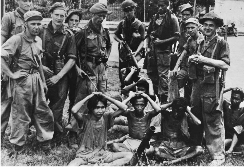
FIGURE 1.3 Dutch troops pose with a captured mortar crew of the Indonesian Republic Army (TNI) in Central Java during the second major Dutch offensive, December 21, 1948.

respective Dutch and British processes of denial, deflecting responsibility, and neutralizing scandals, while organized in different ways, had surprisingly similar outcomes in terms of institutionalizing impunity and thus condoning violence. Thus, while contemporary explanations for extreme violence preferred to place the blame on the aberrant behavior of individuals, a closer study of the evidence concerning what was known at the time and how that knowledge was processed points toward more systemic and structural causes.