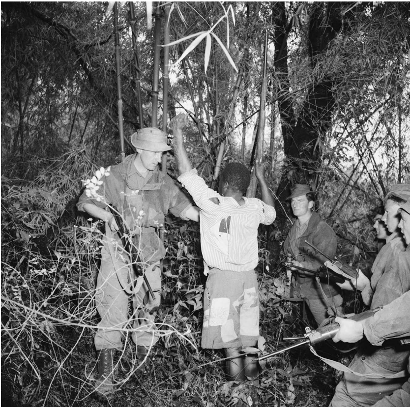
FIGURE 2.1 During the Kenyan Emergency, a British Army patrol searches a man suspected of being a member of the Mau Mau insurgent movement.

South-East Asia (in Singapore) was also involved in information management. Within the colonies a system of emergency committees operated. In Kenya the Provincial Emergency Committees, and their subordinate committees at district level, directed operations in their area. Chaired by the leading colonial official for the area, they brought the administration, military, and police together. They reported ultimately to the War Council presided over by the governor, which decided policy. Finally, the military chain of command stretched back to the War Office. Battalions in the field gave reports to their superior brigade at the end of every planned operation, in addition to real-time updates by radio signal. These were then sent to the headquarters commanding the campaign: Malaya District, or East Africa Command. Malaya District was responsible to the commander in chief, Far Eastern Land Forces. His assessments were sent weekly both to the