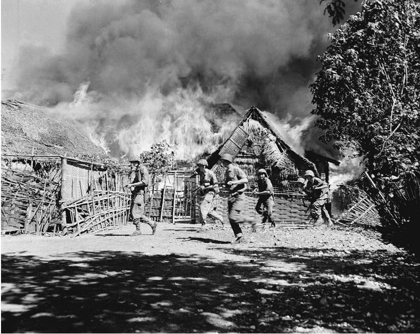
FIGURE 7.2 Dutch marines advance through a burning village while expanding the Dutch-held perimeter around Surabaya in June 1946. Both Dutch and Indonesian armed forces are known to have used arson on a vast scale as a deterrent, collective punishment, and as scorched-earth tactics. In this case, it is unclear who started the fire.

The destructive power of heavy weapons was sometimes also amplified by the geographical circumstances. Broken terrain softens the effect of exploding shells, 56 except when there is lots of hard natural material. Artillery and mortar fire is especially lethal in rocky or wooded terrain: shells hit the treetops or rocks and explode, sending down and around deadly waves of shell fragments and razor-sharp bits of the natural material that was hit (to a lesser extent, sustained machine-gun fire can also achieve this). 57 Part of the fighting in the various Southeast Asian wars discussed, as well as the Mau Mau rebellion in Kenya and the uprising in Madagascar, took place in wooded areas, whether it was (semi-) jungle or the ordered and often tree-rich landscape of plantations. Guerrillas in North Africa often sought refuge in mountainous regions. Attacks with heavy weapons were only effective if enemy forces were in some numbers in the immediate vicinity of the place of impact. But when they were hit in that way, the results could be devastating.