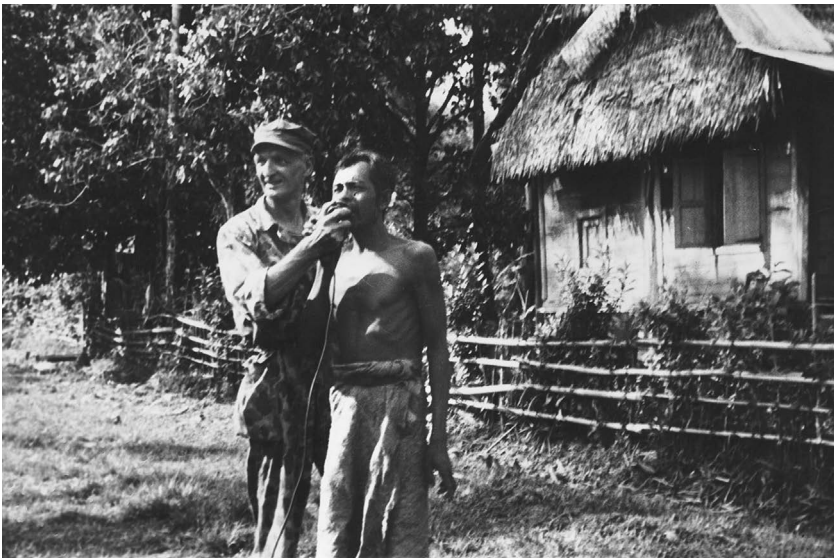
FIGURE 3.2 In Padang, West Sumatra, an Indonesian villager is forced to tell those who have fled that it is safe to return to their homes and to not fear the Dutch presence. 1947.

Recalling our discussion of the Pao An Tui, one might ask whether there was much difference between Republican targeting of the Sundanese and the ethnic Chinese. In both cases the combination of lasting intercommunal frictions and locally specific microdynamics was crucial. Whereas ethnic Chinese had for a long period been cast as unreliable outsiders unsympathetic to the Indonesian national ideal, for the Sundanese such accusations were a direct outcome of the ways violent decolonization played out. They were placed outside the Indonesian Republican nation because of their presumed ideological choice to oppose it.