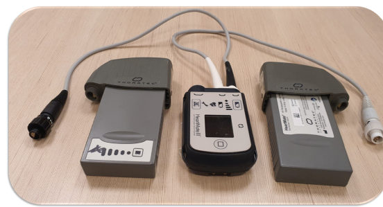
Figure 2 The extracorporeal parts of the HeartMate 3 system including batteries and controller.

This is the speed of the internal rotor spin and is displayed as revolutions per minute. The different devices have different ranges of working device speeds and speed change increments. Pump speed is fixed and set for each device by the LVAD team using specialized equipment. Current devices are programmed to temporarily reduce the speed to a set value in case of diminished blood flow to the device. This lower speed is also set by the LVAD team.