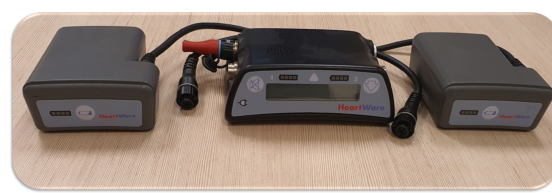
Figure 3 The extracorporeal parts of the HeartWare system including batteries and controller.