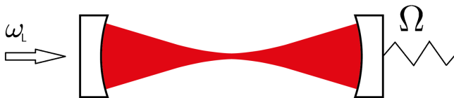
Figure 1.1: Basic optomechanical system.

We see that the intracavity light amplitude is a function of the distance between the mirrors. Therefore, the mechanical motion of the movable mirror affects the intracavity light fields. Further we will see that there is also a reverse effect where the intracavity light affects the motion of the mirror - hence the name optomechanics.