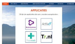
Fig. eRehabilitation intervention with applications for physical and cognitive exercises, activity monitoring and stroke-related education.